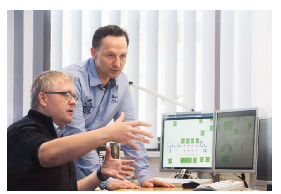
We have been working on the energy system of the future for years

targeted reduction in emissions in building heating