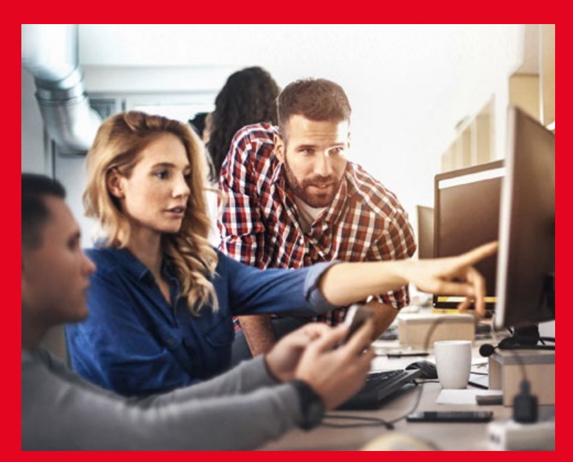
Working to achieve the energy turnaround - that is what MVV stands for

We are an attractive employer. All companies say that but for us it is not just lip service. We are implementing numerous measures. Our aim is to create a basis for motivating our employees to be the movers and shakers in the energy system of the future.