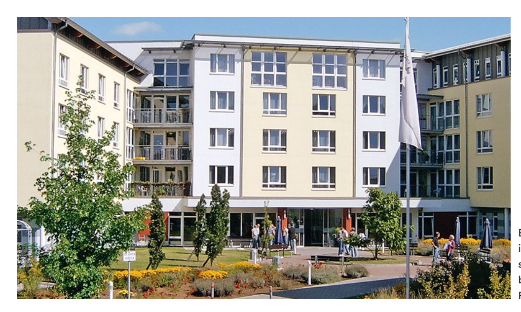
Energy partnership in Kaiserslautern – senior citizens centre run by DRK-Landesverband Rheinland-Pfalz

Any organisation developing as dynamically as the Kaiserslautern location of DRK-Landesverband Rheinland-Pfalz e. V., and that over such a short space of time, has very specific needs in the partners who accompany it.