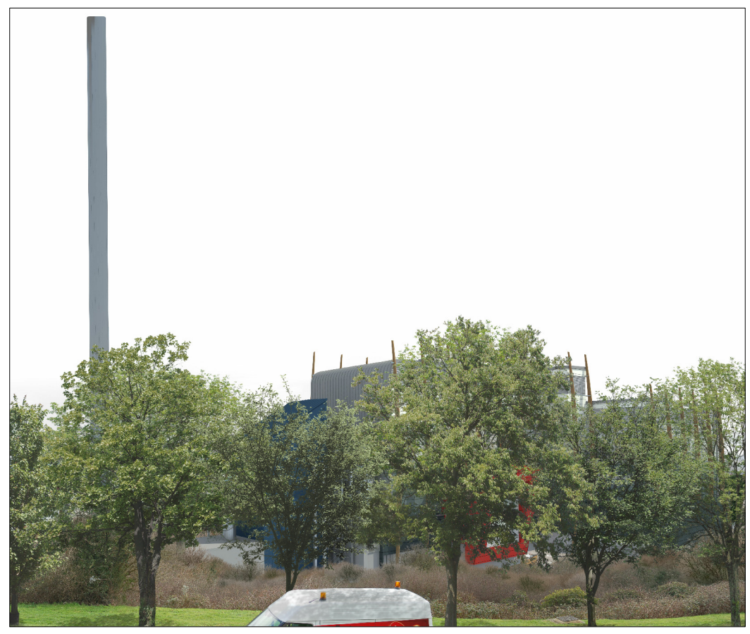
Proposed view 4a with trees at 15 years (approx)