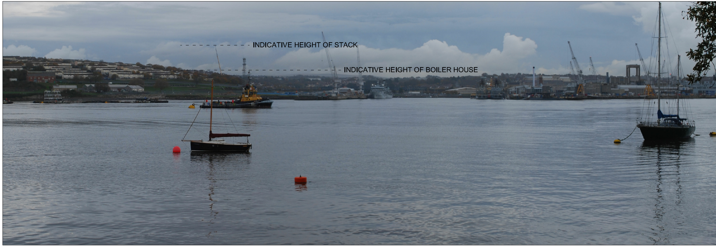
Existing view 31

Note: Photomontage does not show landscape proposals.