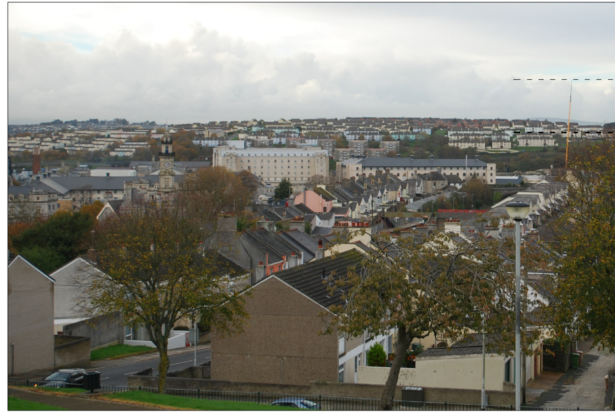
Existing view 19

Due to the angle of this location, the perspective causes the lowered hook to appear lower than the proposed building in the foreground.