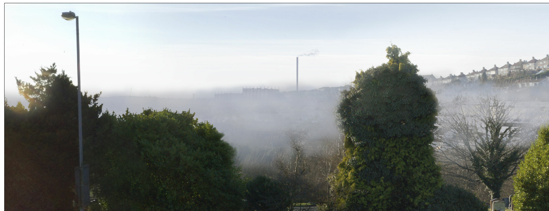
Proposed view 12 with plume from stack and mist in the Tamar Valley