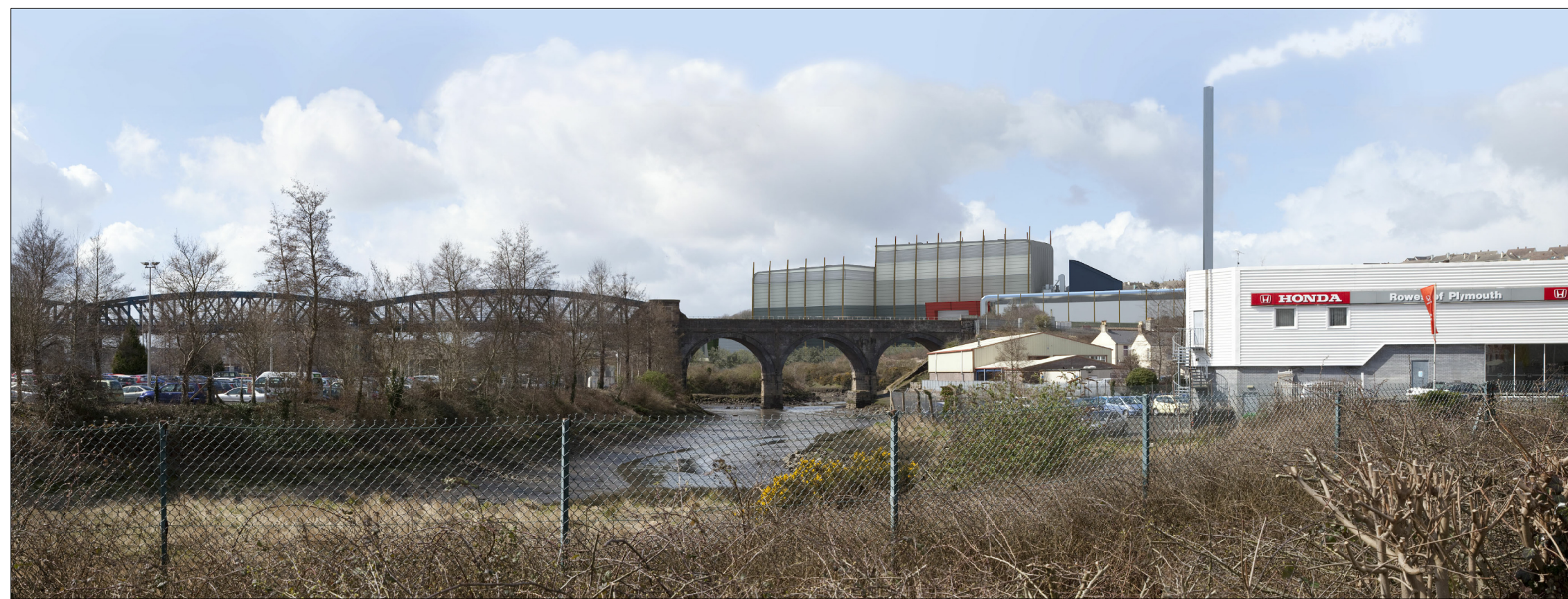
Proposed view 13a with average plume from stack