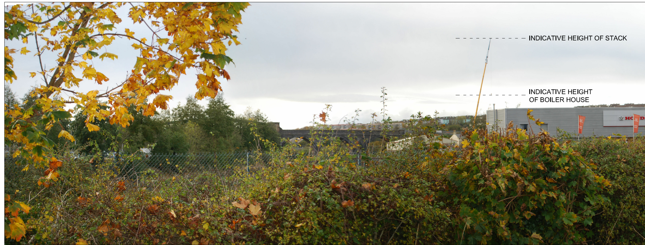
Existing view 13a

Note: This bottom photomontage represents the average visible plume length (53.7m) calculated from Meteorological Office data from 2005-2009. The Plume Visibility Assessment results noted in Appendix 13.1 state that of the five years analysed the plume is only visible at all for 16.3% of the time. This is shown for the South-Westerly prevailing wind (the most dominant wind direction for this location).