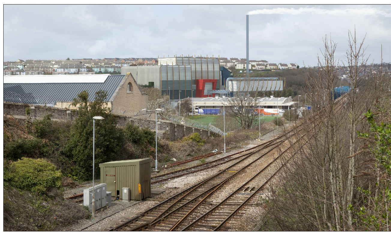
Proposed view 16 with maximum plume from stack