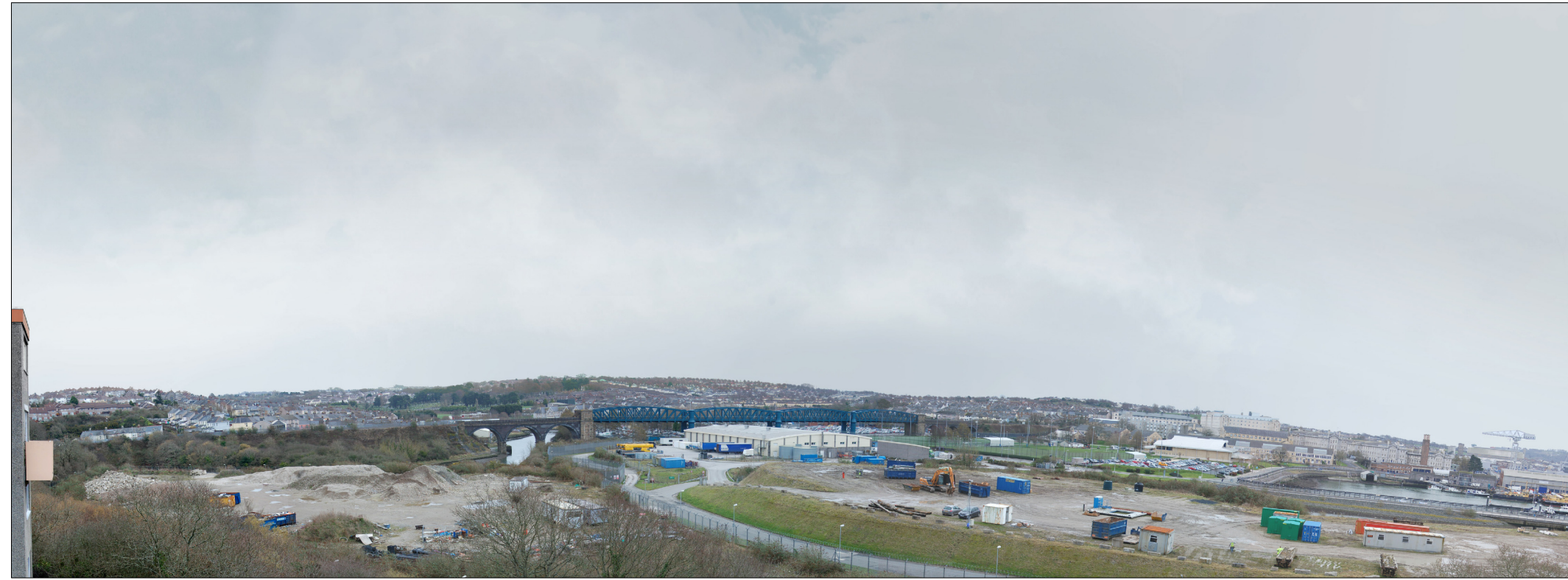
Existing viewpoint 3b

Note: Photographs taken during 'winter' conditions to represent worst-case scenario without deciduous foliage.