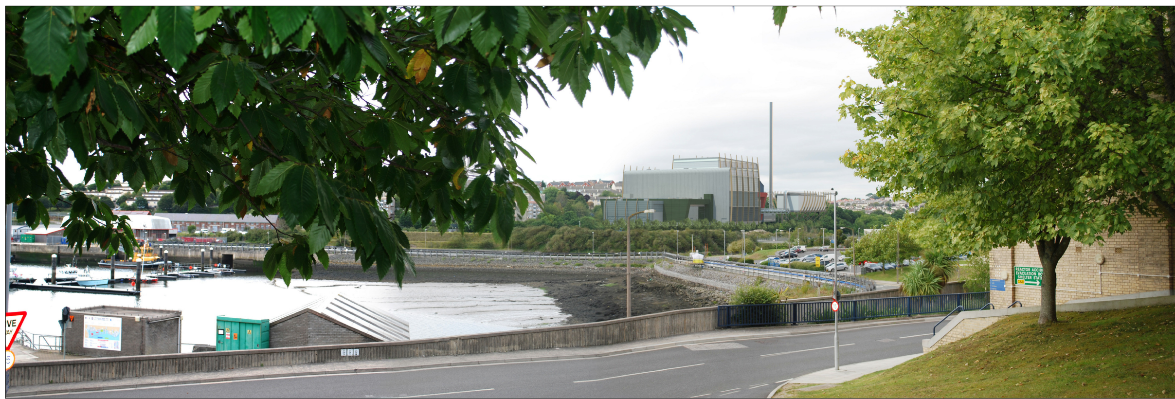
Proposed view 54