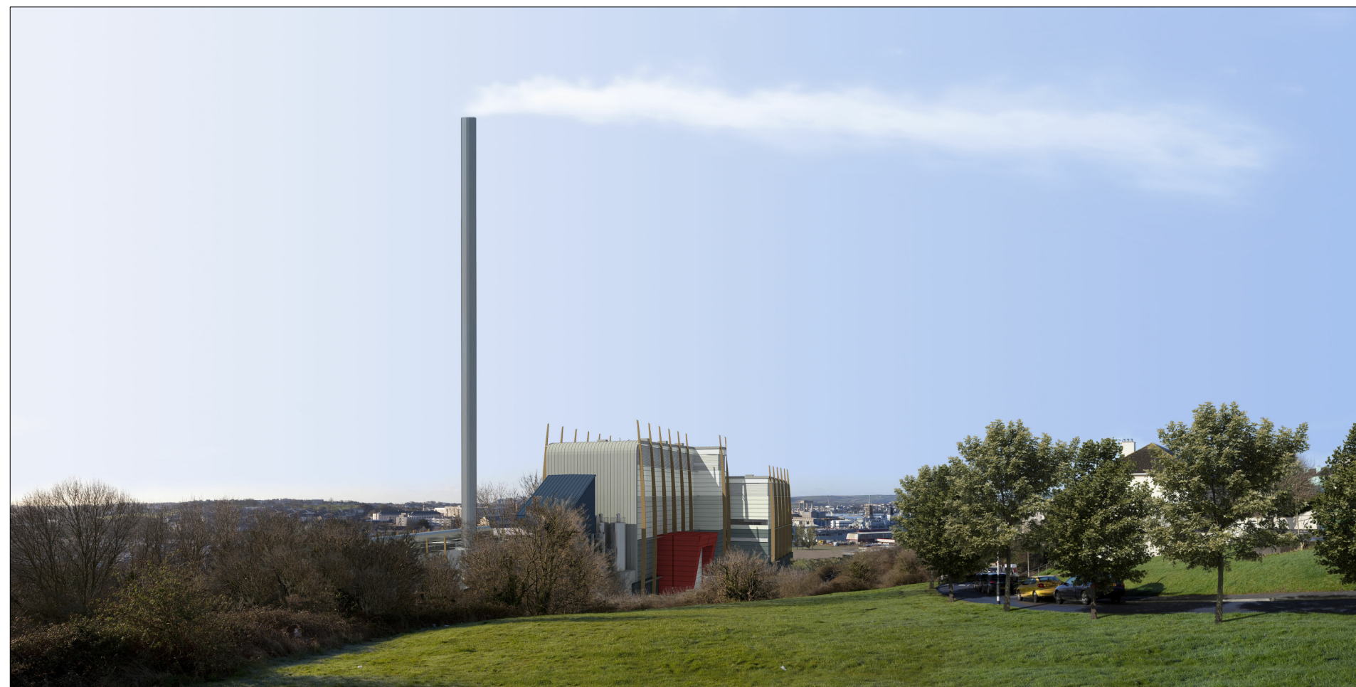
Proposed view 4d with maximum plume from stack

Note: The photomontage represents the longest visible plume length (177.6m) calculated from Meteorological Office data from 2005-2009. This is shown for an easterly prevailing wind (the second most dominant wind direction for this location) when viewed from this viewpoint as this shows the longest profile. The Plume Visibility Assessment results noted in Appendix 13.1 state that of the five years analysed the plume is only visible at all for 16.3% of the time.