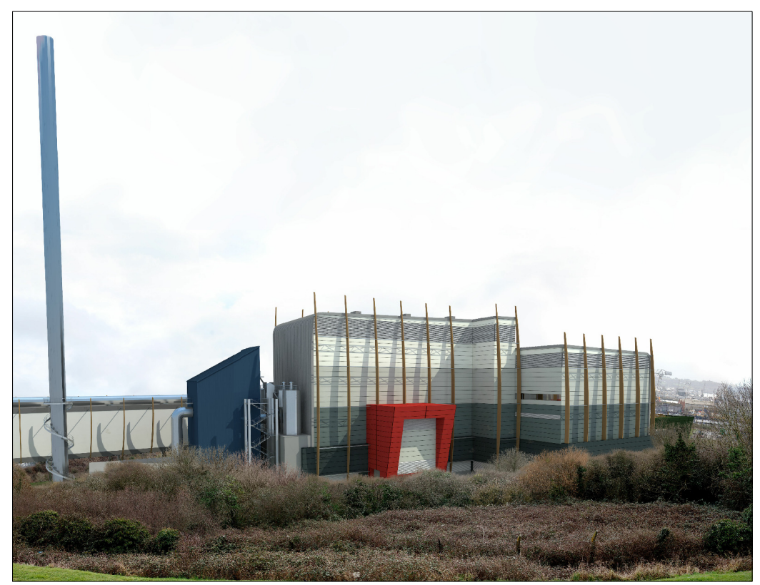
Proposed view 4b

MITIGATION PLANTING ON SAVAGE ROAD SHOWN. PROPOSED PLANTING WITHIN BLACKIES WOOD AND SITE NOT SHOWN.