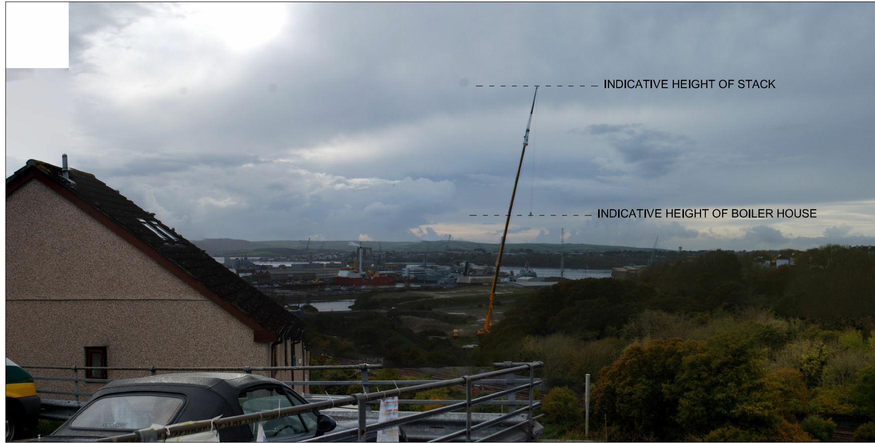
Existing view 6

Due to the close proximity and angle of this location, the perspective causes the lowered hook to appear noticeably higher than the proposed building in the background.