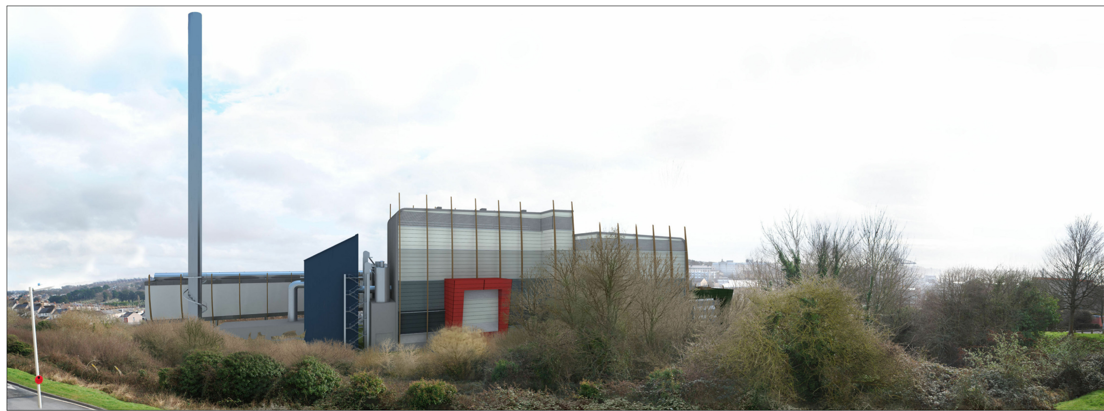
Proposed view 4c