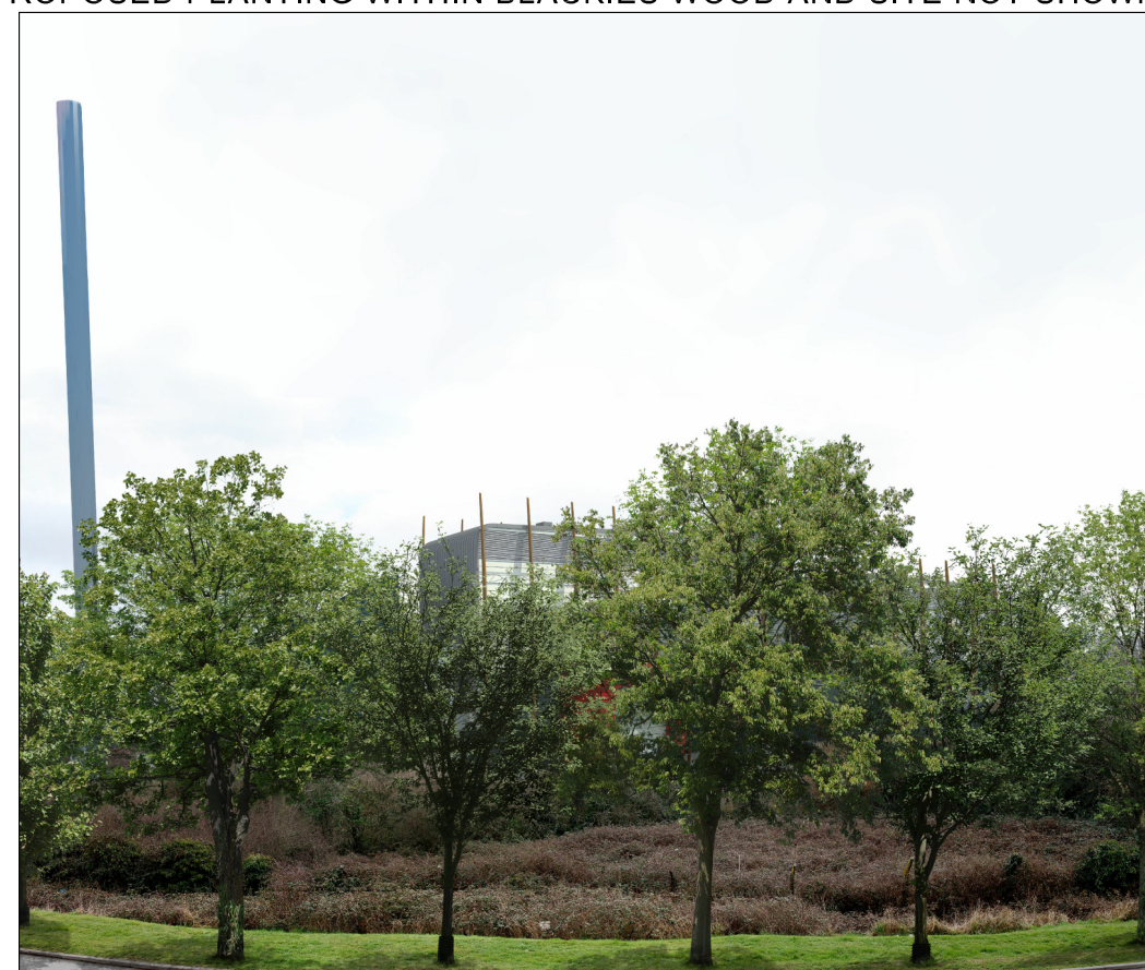
Proposed view 4b with trees at 15 years (approx)

MITIGATION PLANTING ON SAVAGE ROAD SHOWN. PROPOSED PLANTING WITHIN BLACKIES WOOD AND SITE NOT SHOWN.