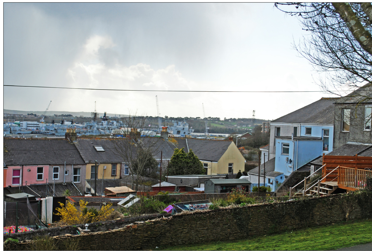
Existing view 9

Note: Photomontage does not show landscape proposals.