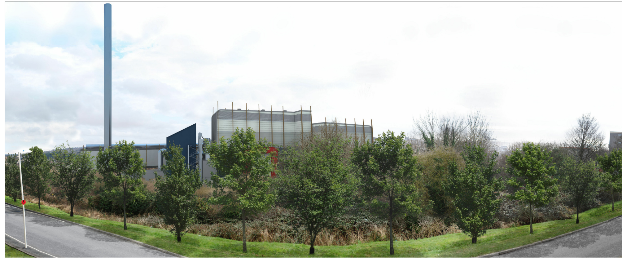
Proposed view 4c with trees at 5 years (approx)

Note: Photomontages do not show full landscape proposals.