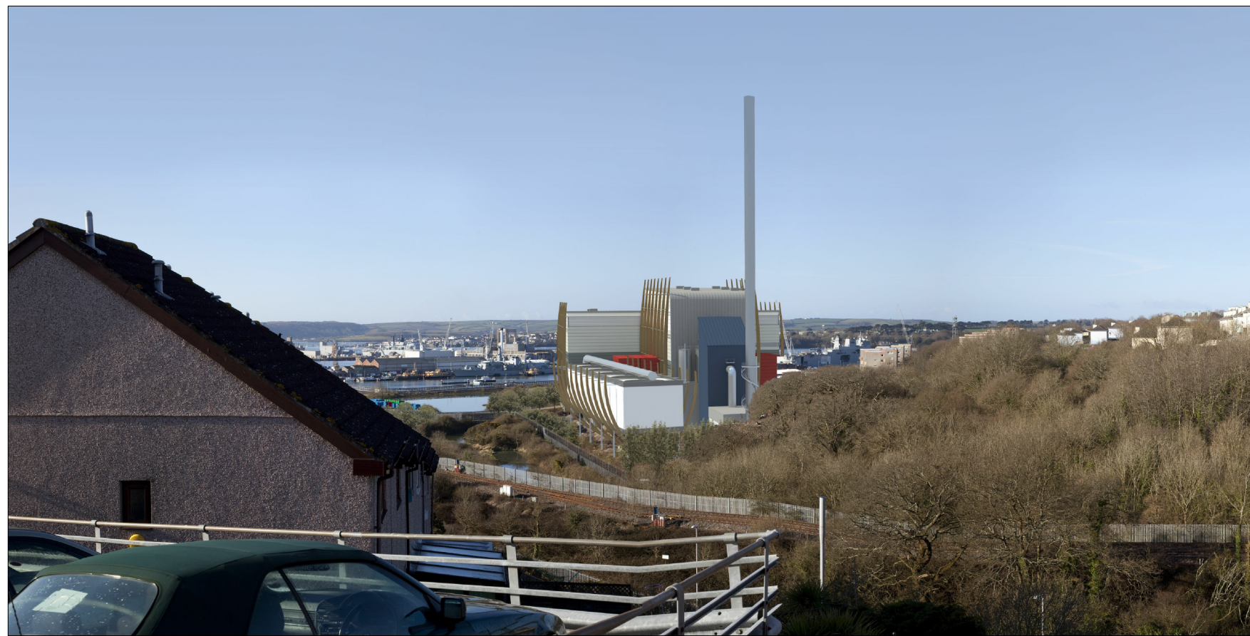
Proposed view 6