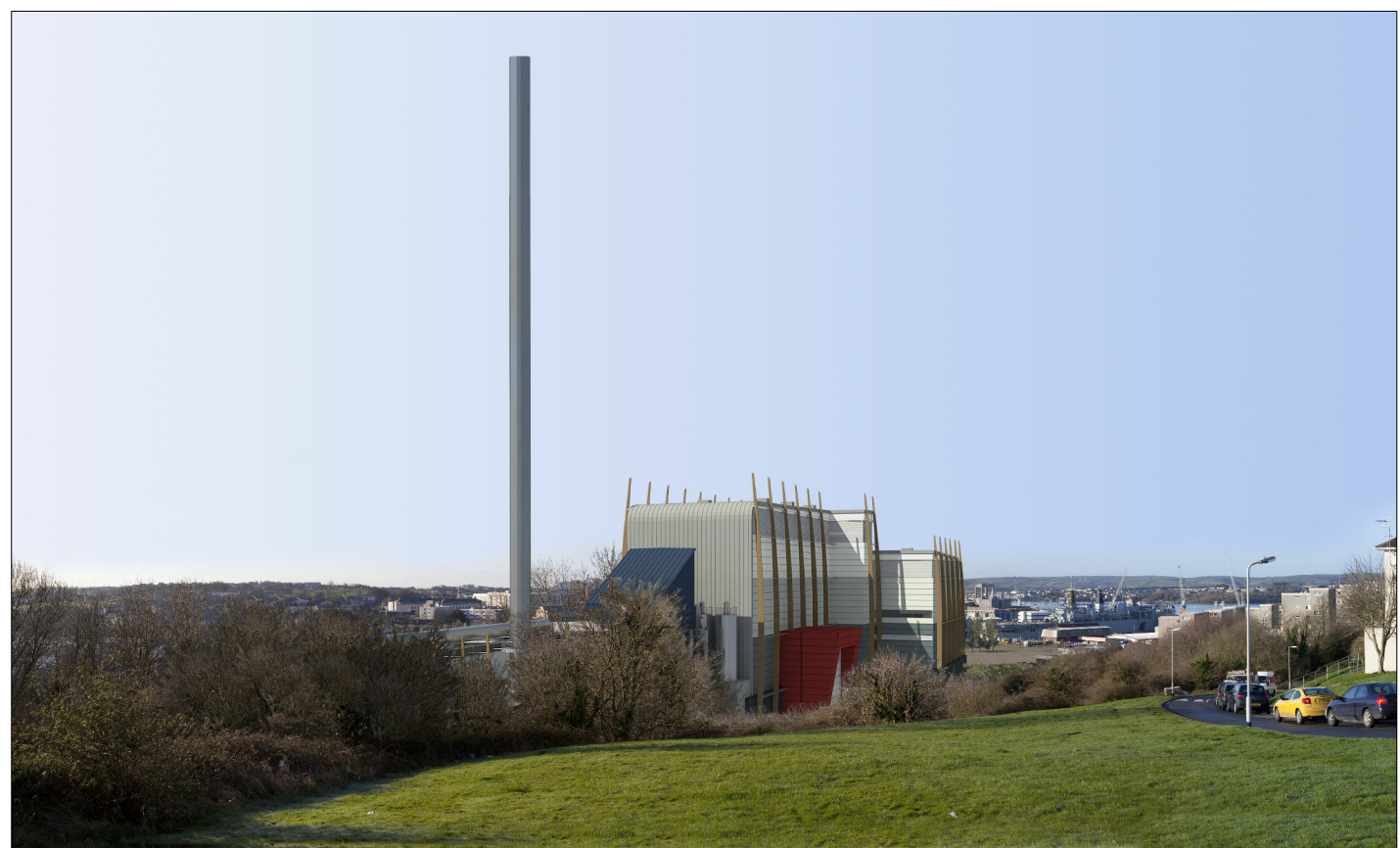
Proposed view 4d