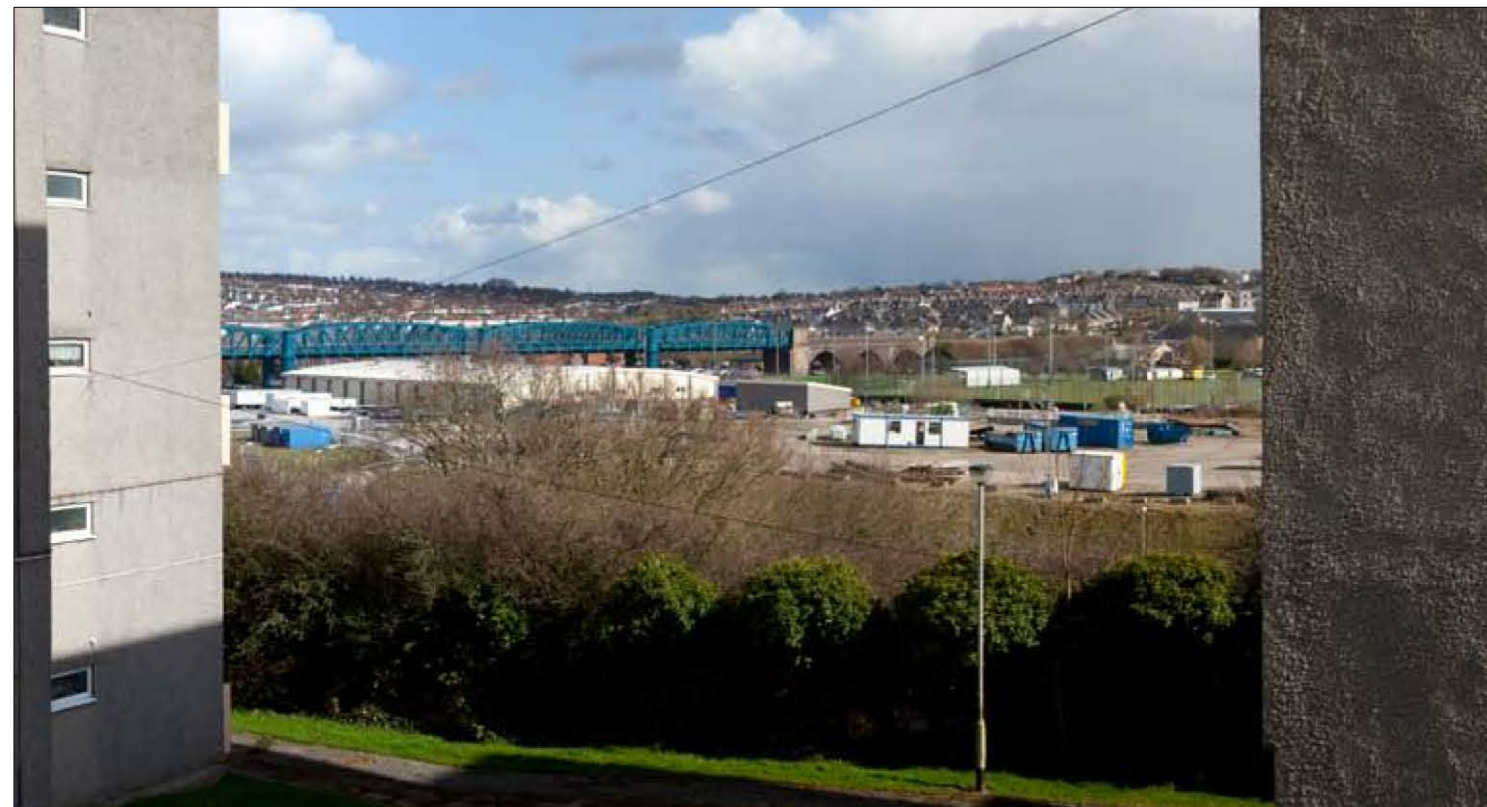
Existing view 3a

Note: Photomontage does not show full landscape proposals.