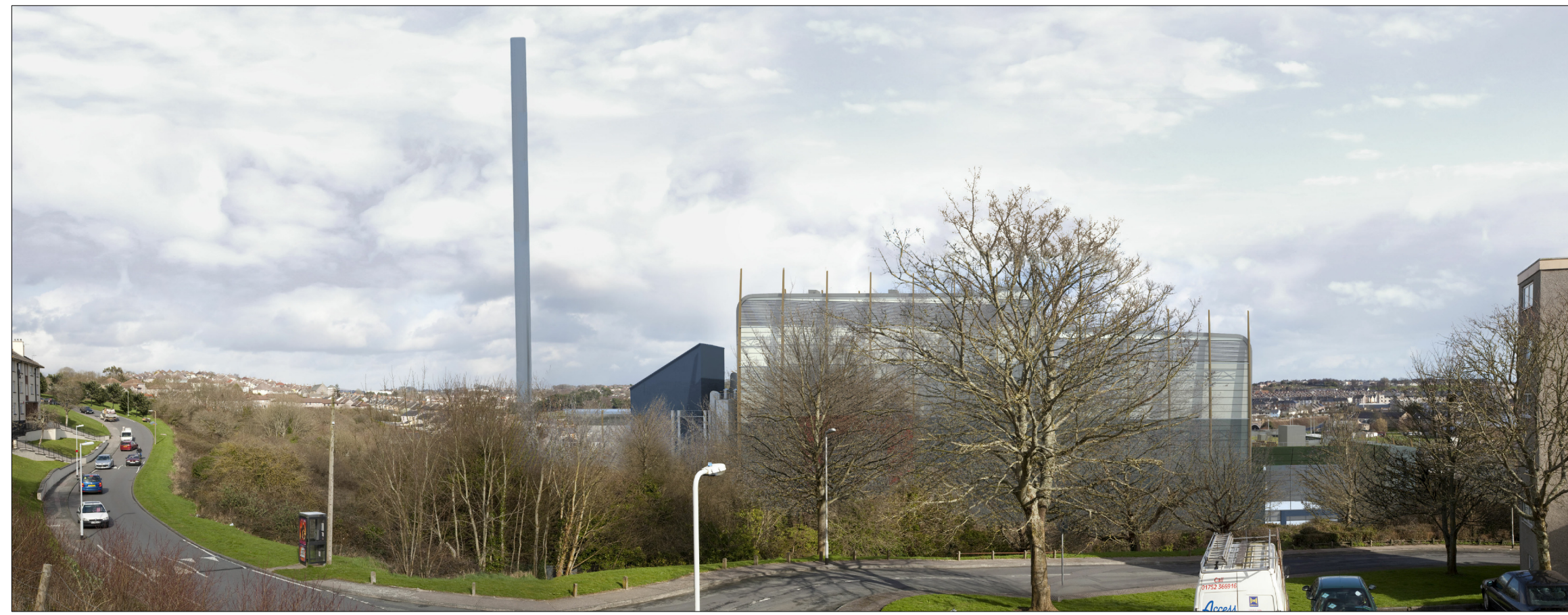
Proposed view 4