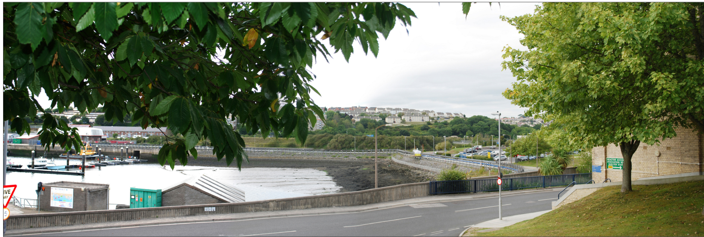
Existing view 54

Note: Photomontages do not show full landscape proposals.