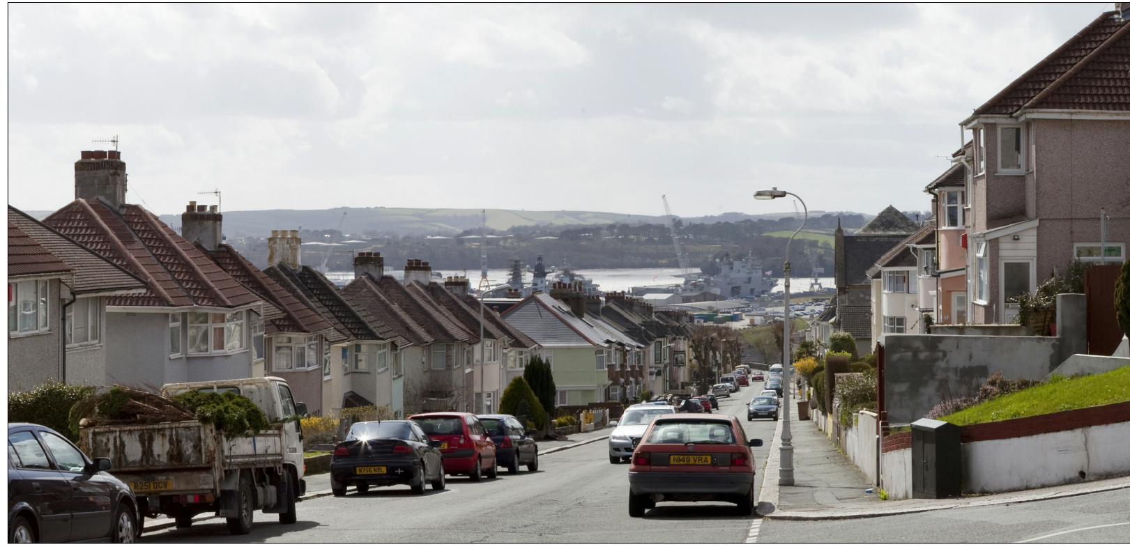
Existing view 10a

Note: Photomontage does not show landscape proposals.