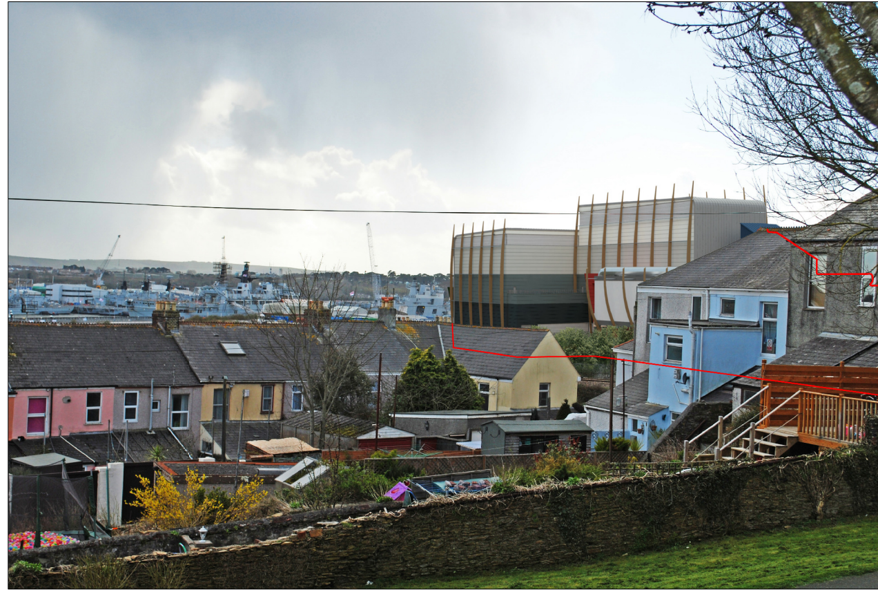
Proposed view 9 with stack highlighted

Red line indicates extent of proposed building not visible from this location.