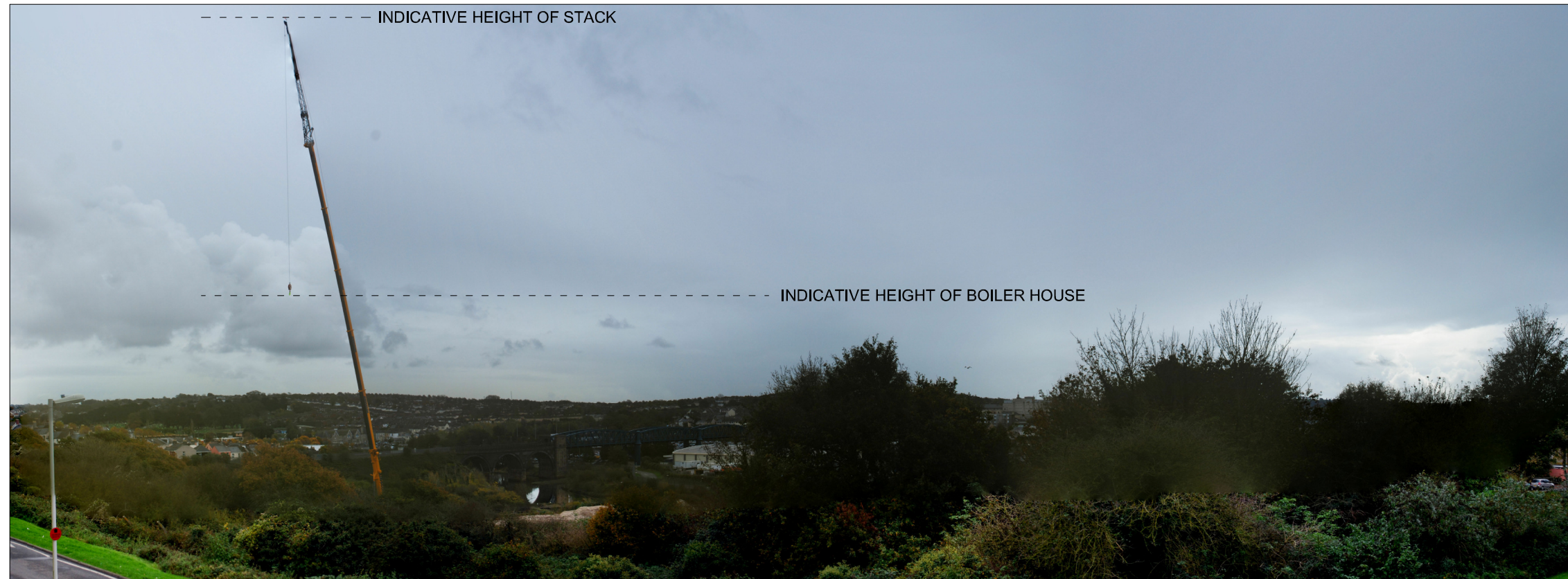
Existing view 4c

Note: Photomontage does not show landscape proposals.