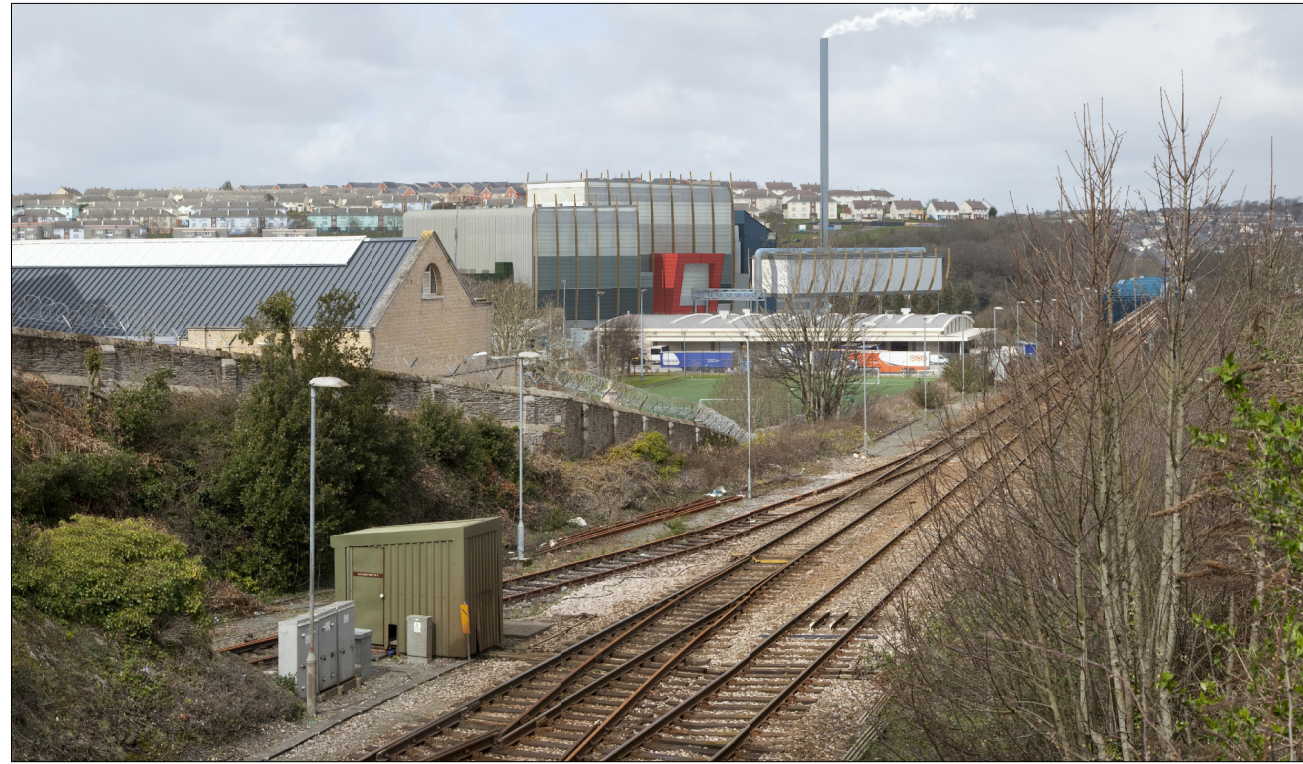
Proposed view 16 with average plume from stack

Note: The bottom photomontage represents the longest visible plume length (177.6m) calculated from Meteorological Office data from 2005-2009. This is shown for a southwesterly prevailing wind (the most dominant wind direction for this location) when viewed from this viewpoint as this shows the longest profile. The Plume Visibility Assessment results noted in Appendix 13.1 state that of the five years analysed the plume is only visible at all for 16.3% of the time.