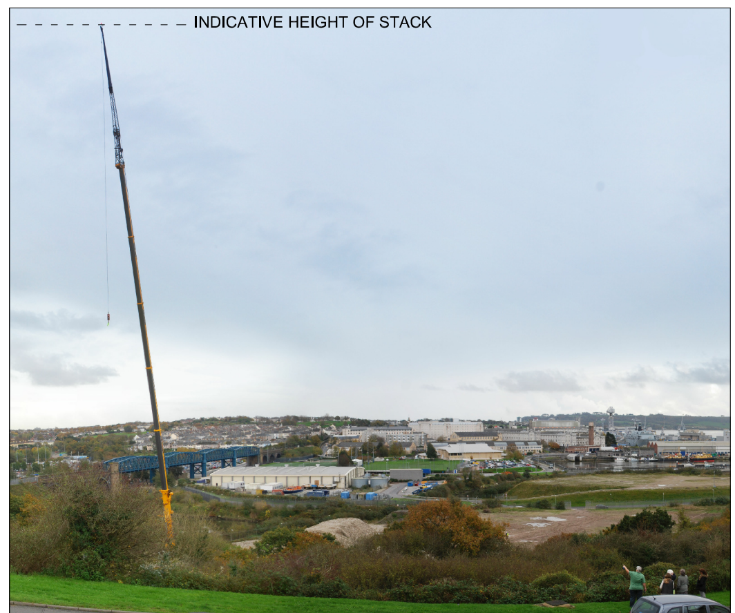
Existing View 4a

Due to the close proximity and angle of this location, the perspective causes the lowered hook to appear noticeably higher than the proposed building in the background.