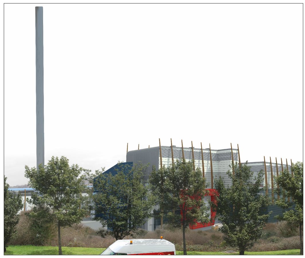
Proposed view 4a with trees at 5 years (approx)

Note: Photomontages do not show full landscape proposals.