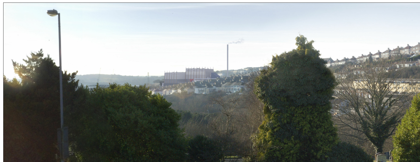
Proposed view 12 with average plume from stack

The bottom photomontage in addition to this plume, also represents a temperature inversion condition is represented by low lying 'fog' within the Tamar Valley as this is a relatively frequent occurrence in this location.