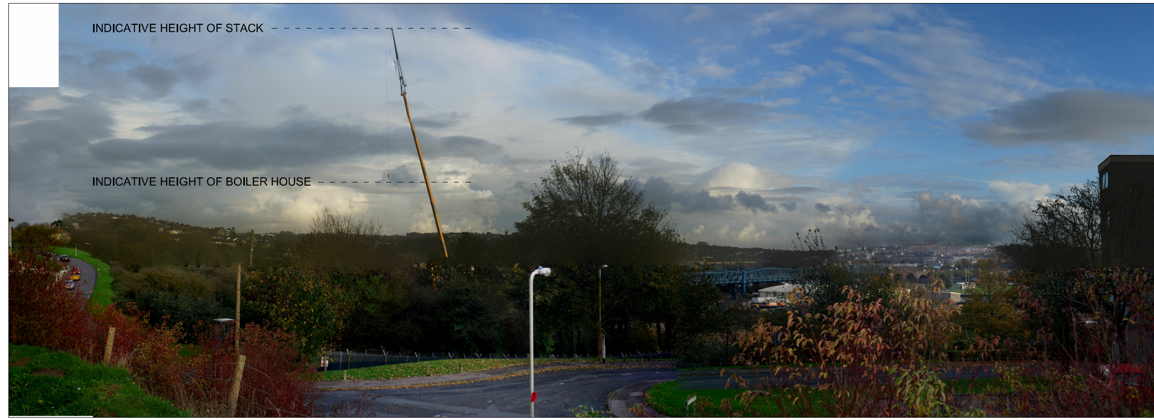
Existing view 4

Due to the close proximity and angle of this location, the perspective causes the lowered hook to appear noticeably lower than the proposed building in the foreground.