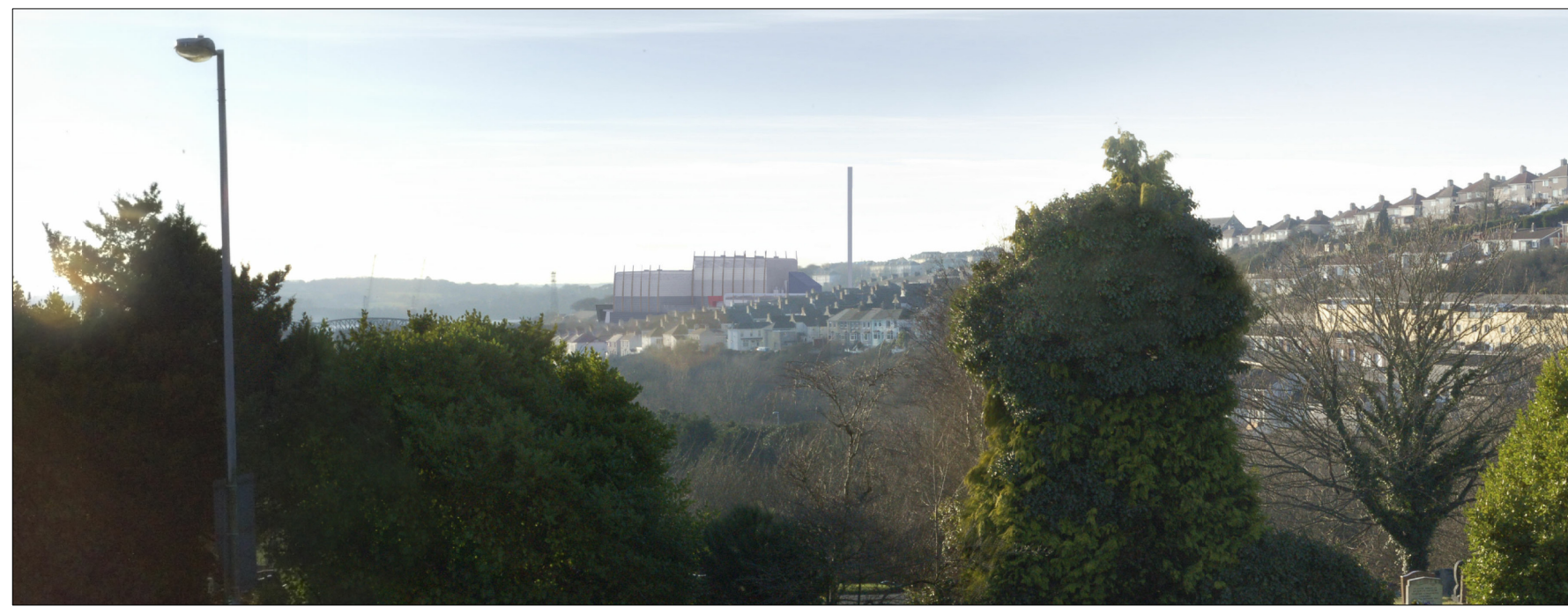
Proposed view 12