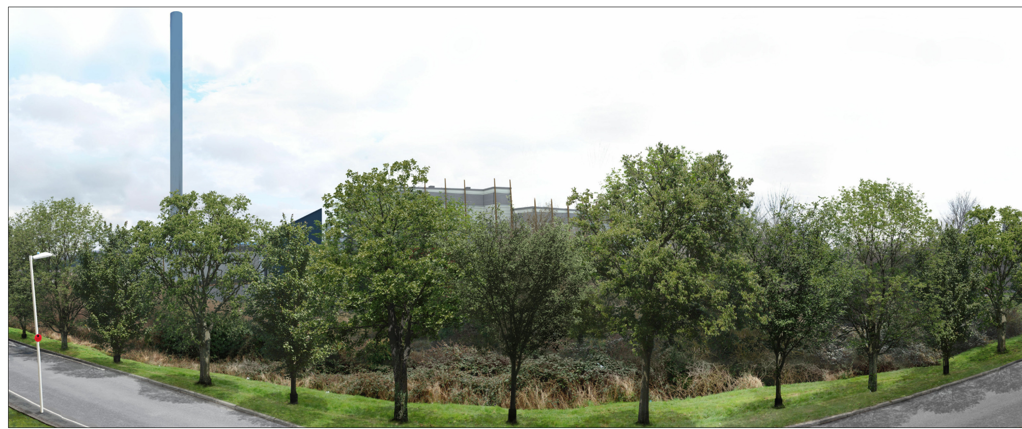
Proposed view 4c with trees at 15 years (approx)