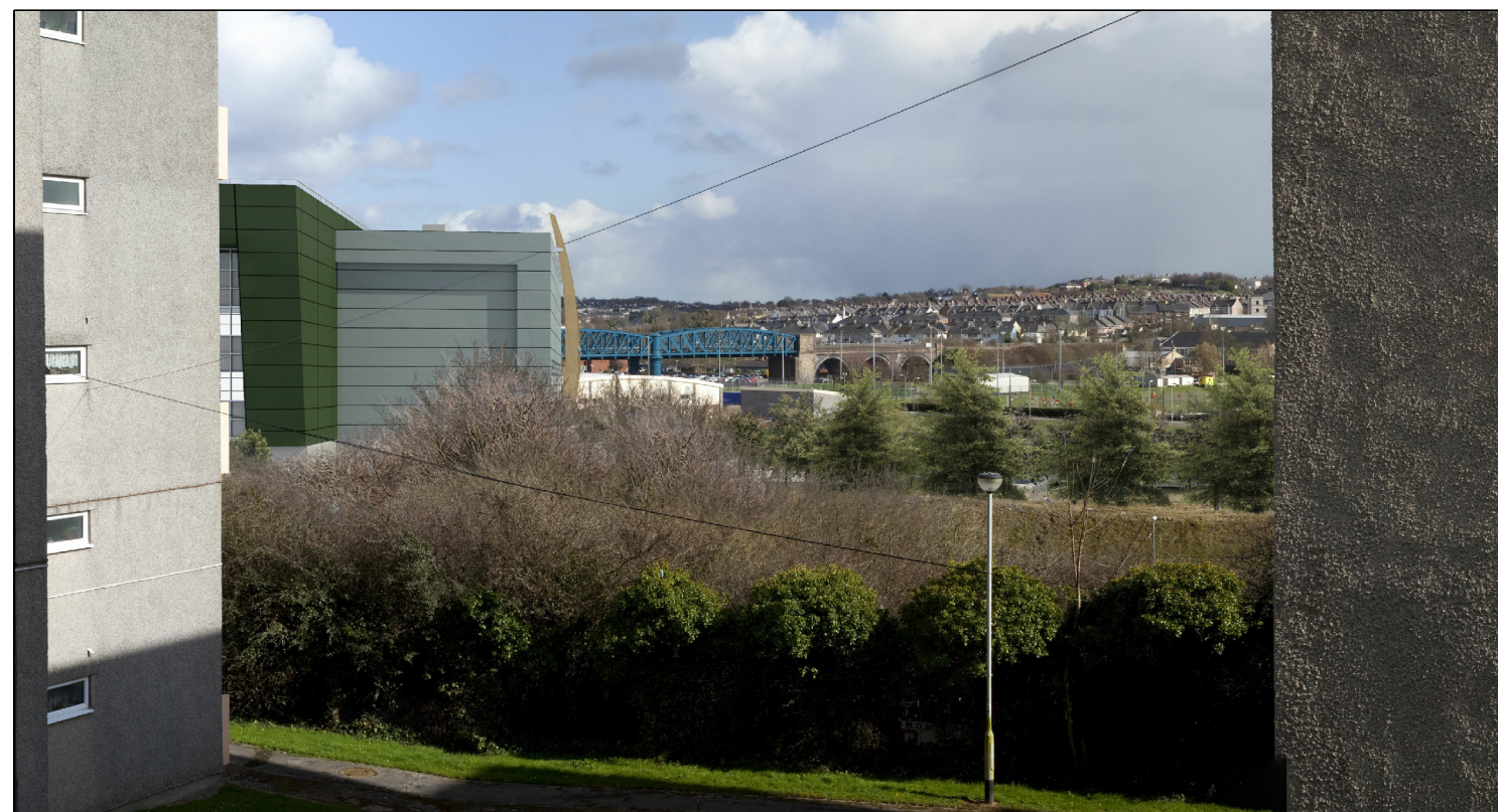
Proposed view 3a