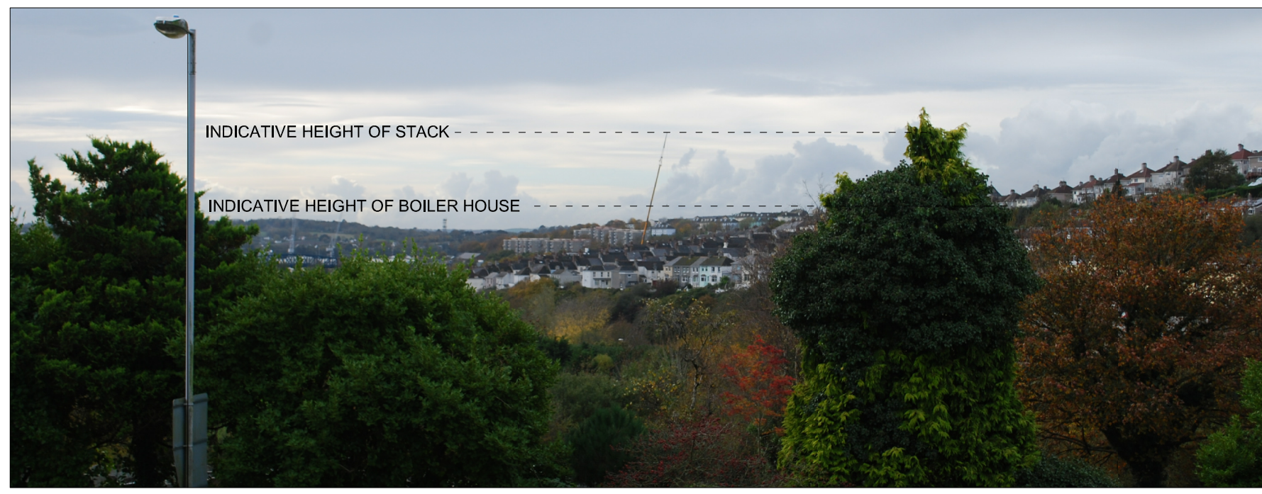
Existing view 12

Note: Photomontage does not show landscape proposals.