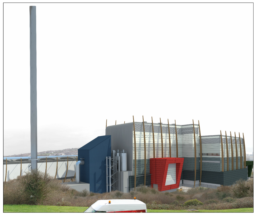
Proposed view 4a