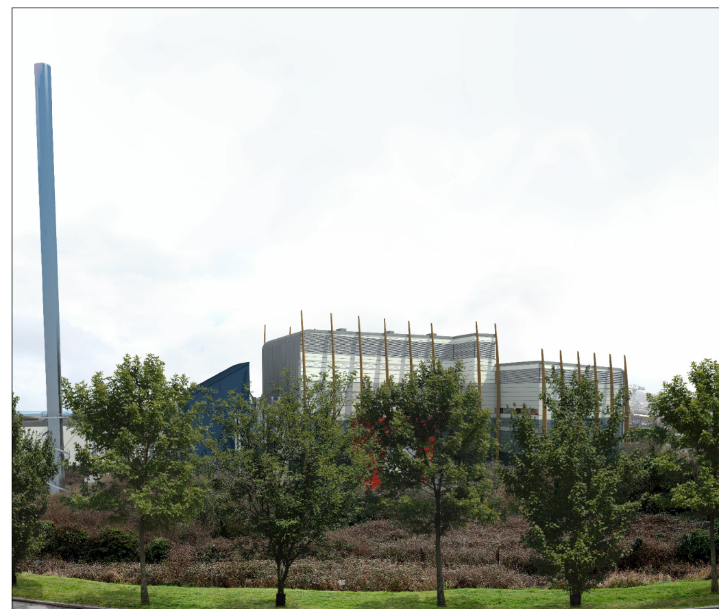
Proposed view 4b with trees at 5 years (approx)

Note: Photomontages do not show full landscape proposals.