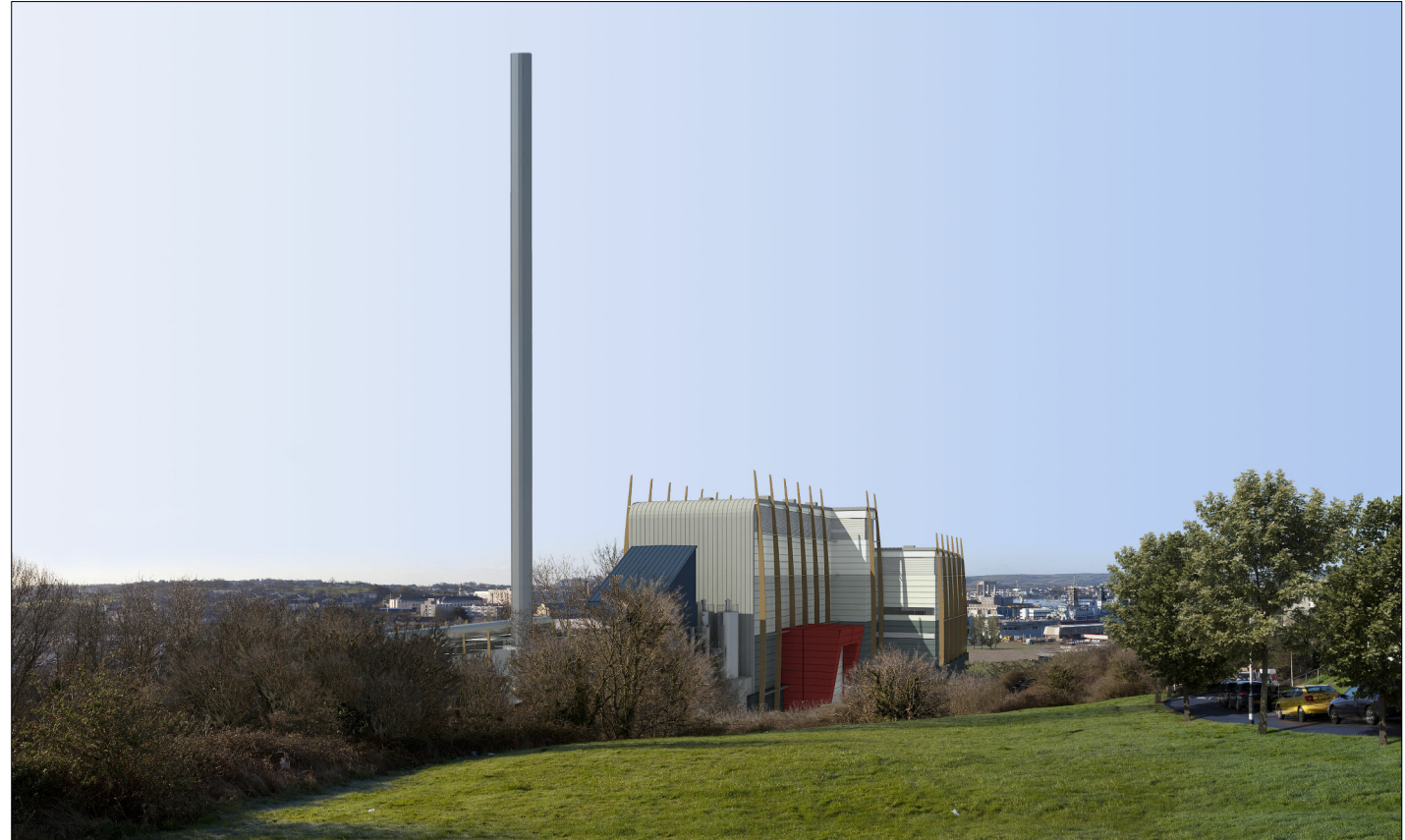
Proposed view 4d

Note: The bottom photomontage represents the average visible plume length (53.7m) calculated from Meteorological Office data from 2005-2009. This is shown for an easterly prevailing wind (the second most dominant wind direction for this location) when viewed from this viewpoint as this shows the longest profile. The Plume Visibility Assessment results noted in Appendix 13.1 state that of the five years analysed the plume is only visible at all for 16.3% of the time.