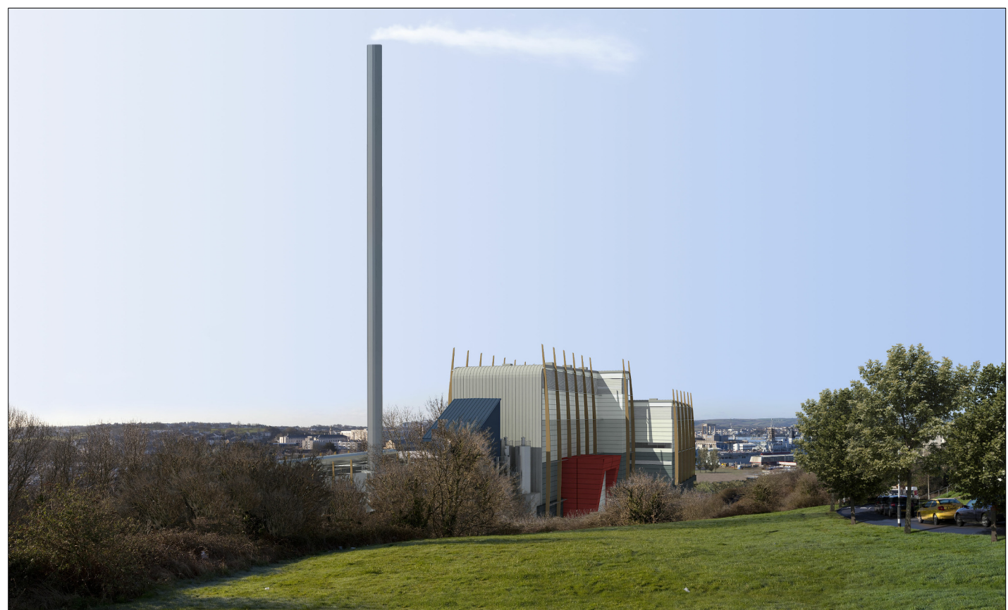
Proposed view 4d with average plume from stack