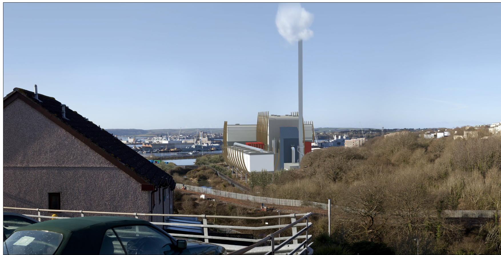
Proposed view 6 with average plume from stack