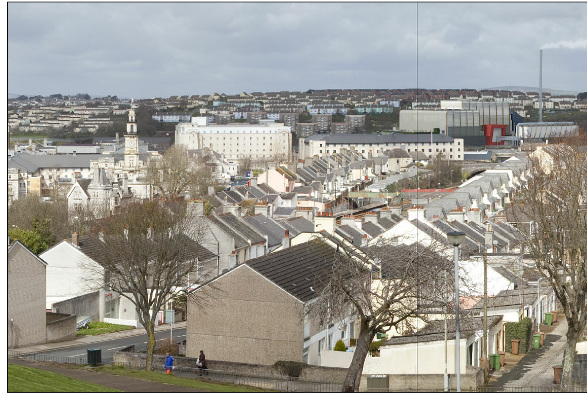
Proposed view 19 with plume from stack