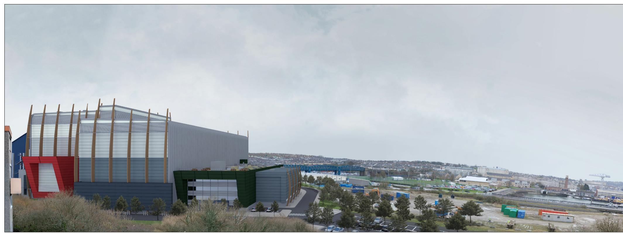
Proposed viewpoint 3b