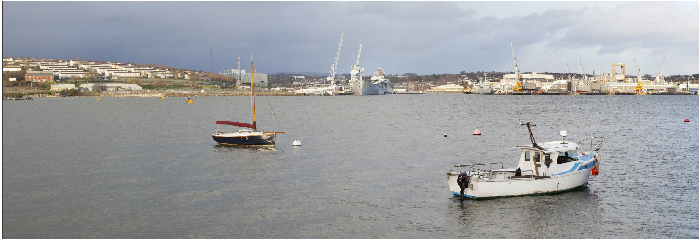
Proposed view 31