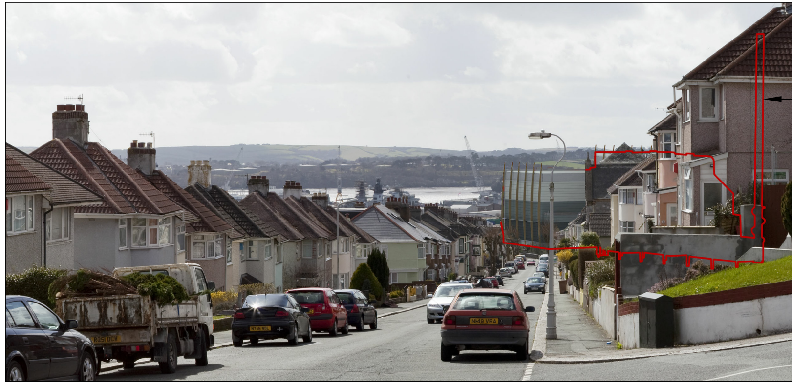
Proposed view 10a with stack highlighted

Red line indicates extent of proposed building not visible from this location.