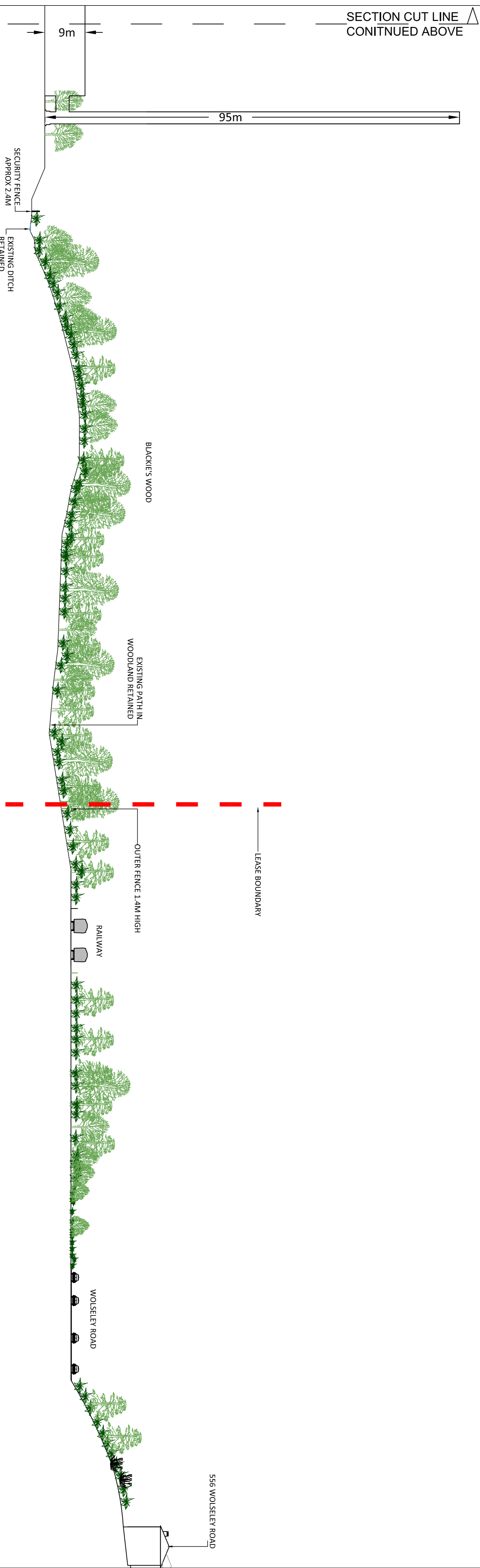
SECTION CUT LINE CONTINUED ABOVE