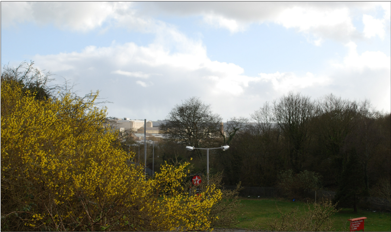
Viewpoint 17a Winter

THIS DRAWING MAY BE USED ONLY FOR THE PURPOSE INTENDED AND ONLY WRITTEN DIMENSIONS SHALL BE USED