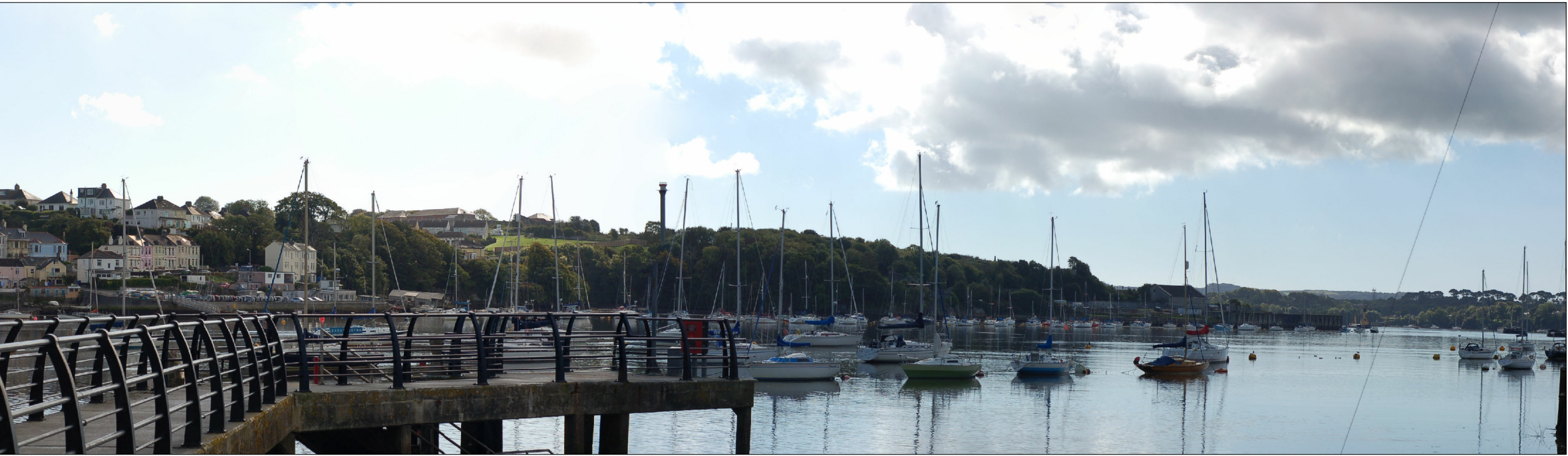
Viewpoint 22 Summer