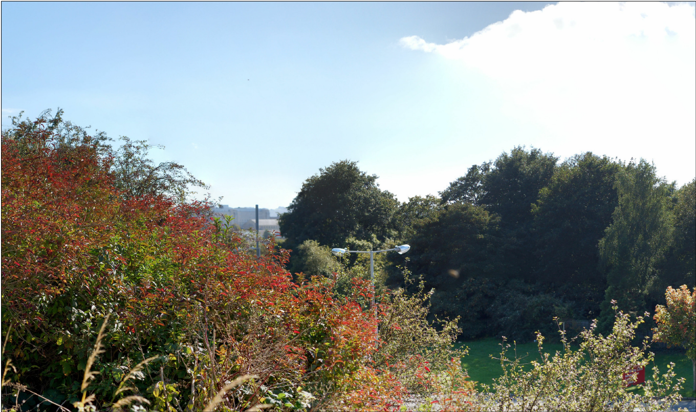
Viewpoint 17a Summer