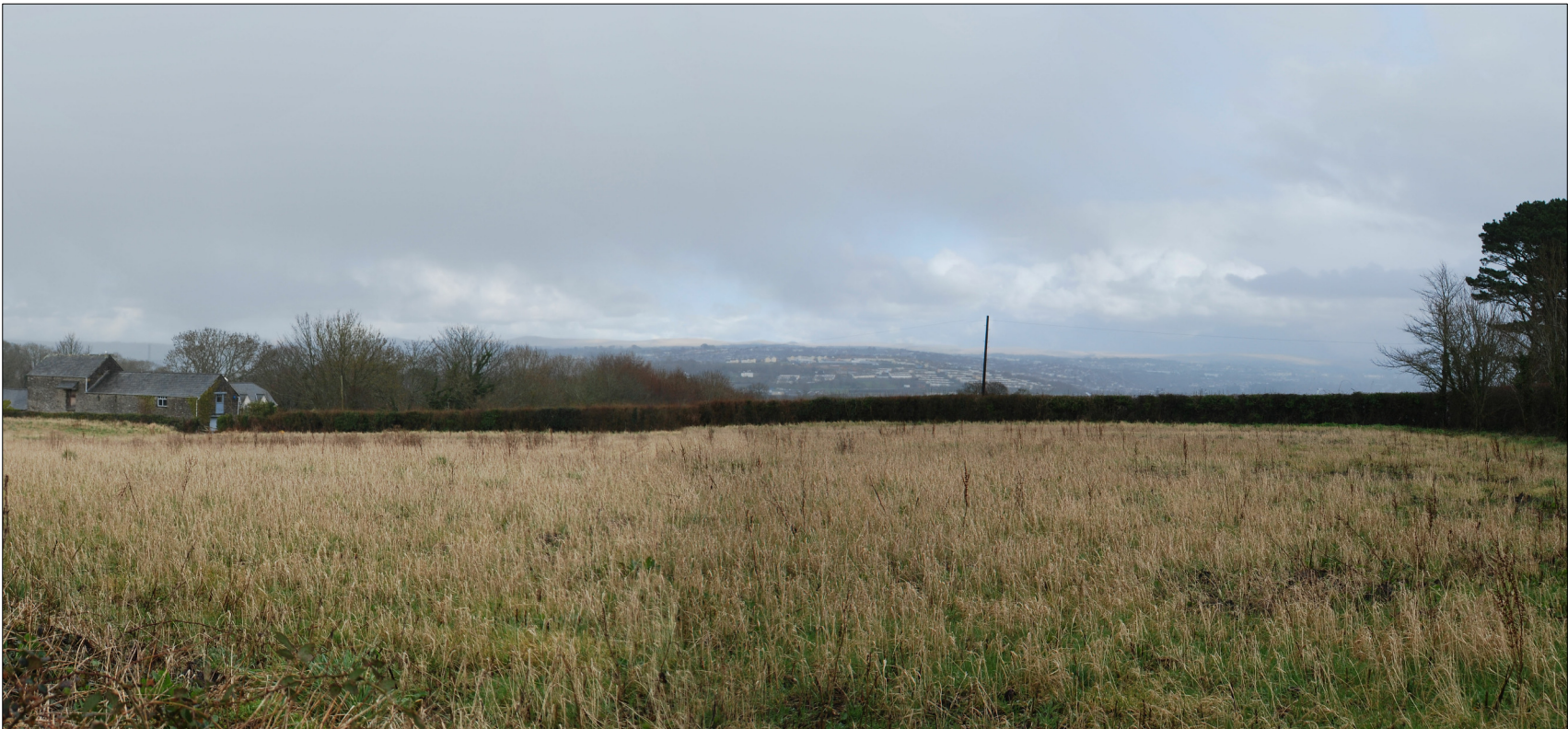
Viewpoint 29 Winter

THIS DRAWING MAY BE USED ONLY FOR THE PURPOSE INTENDED AND ONLY WRITTEN DIMENSIONS SHALL BE USED