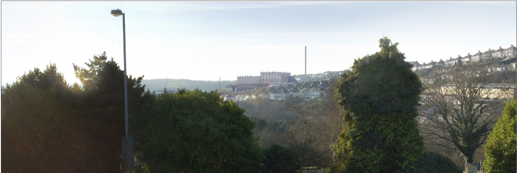
Proposed view 12

Note: Photomontage does not show landscape proposals.