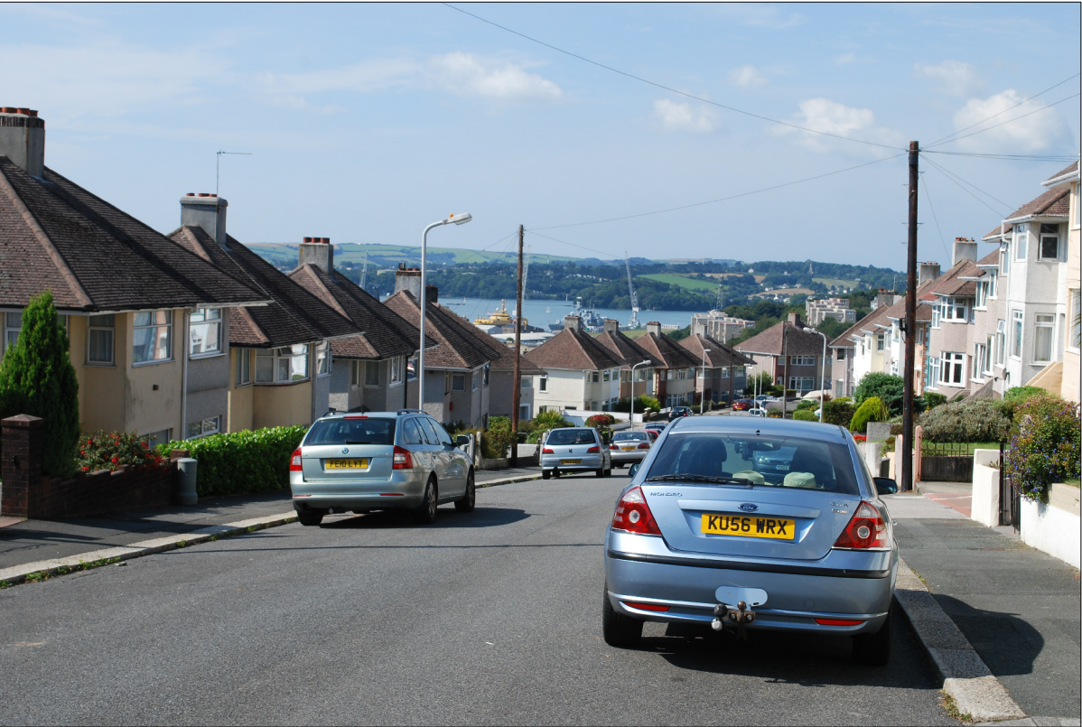
Viewpoint 11 Summer