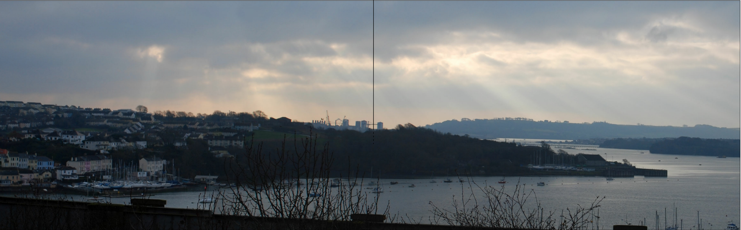
Viewpoint 23 Winter

THIS DRAWING MAY BE USED ONLY FOR THE PURPOSE INTENDED AND ONLY WRITTEN DIMENSIONS SHALL BE USED