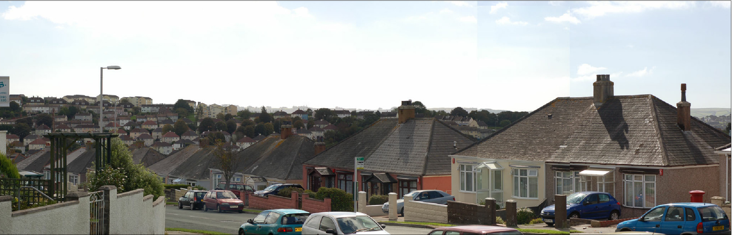
Viewpoint 21 Summer