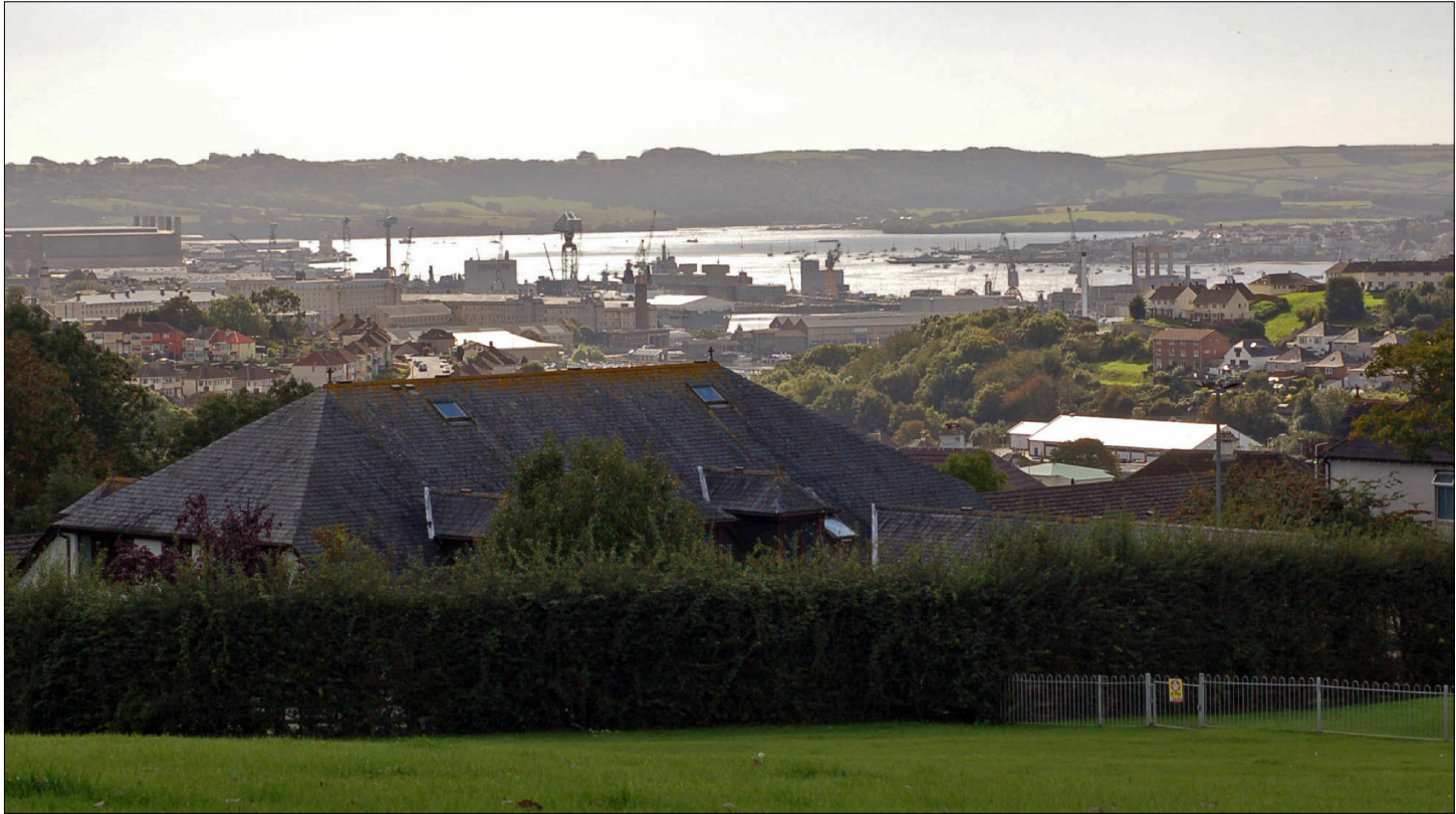
Viewpoint 20 Summer