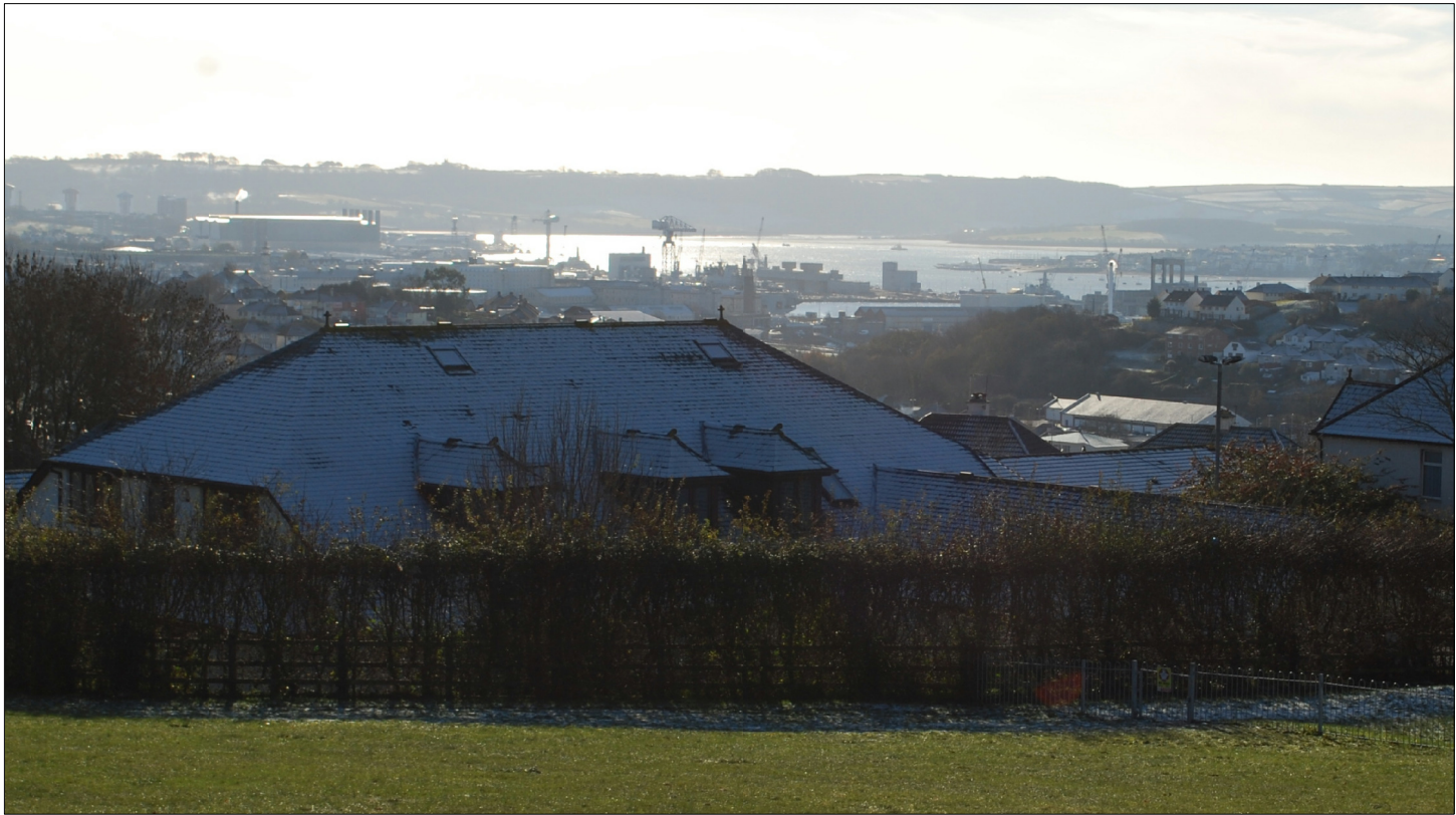
Viewpoint 20 Winter

THIS DRAWING MAY BE USED ONLY FOR THE PURPOSE INTENDED AND ONLY WRITTEN DIMENSIONS SHALL BE USED