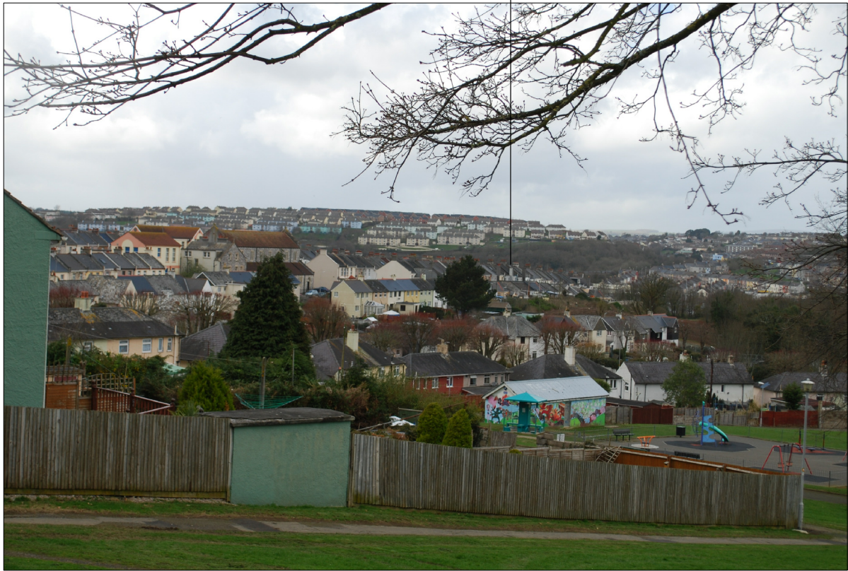
Viewpoint 18 Winter

THIS DRAWING MAY BE USED ONLY FOR THE PURPOSE INTENDED AND ONLY WRITTEN DIMENSIONS SHALL BE USED