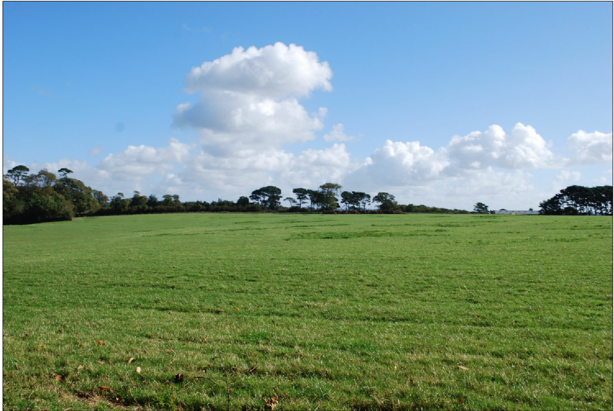
Viewpoint 27 Summer