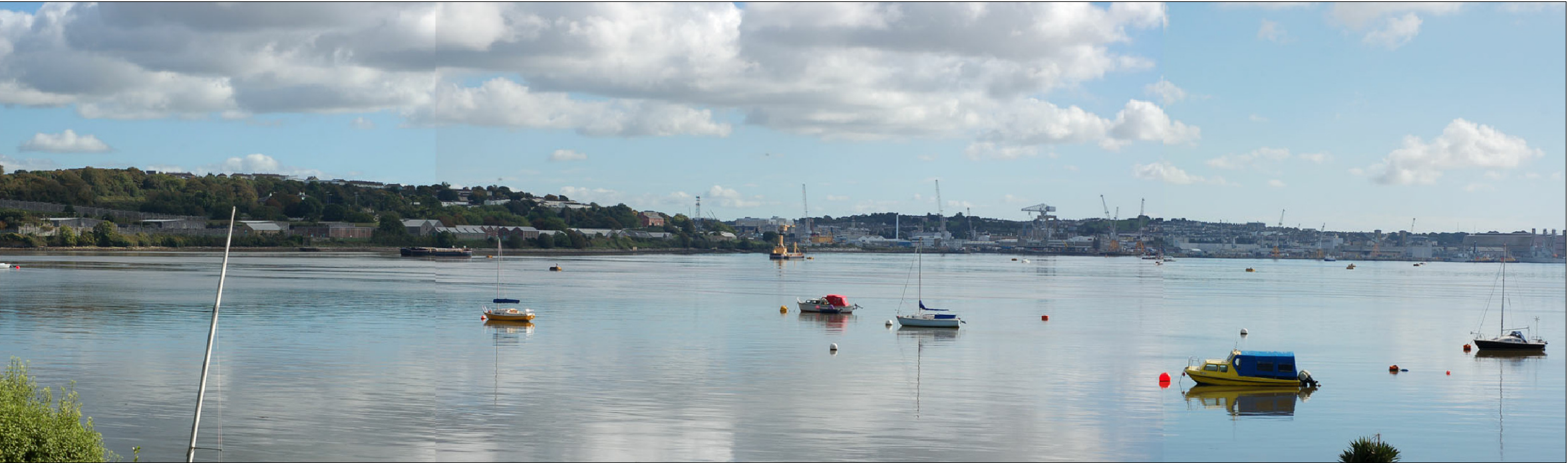
Viewpoint 25 Summer