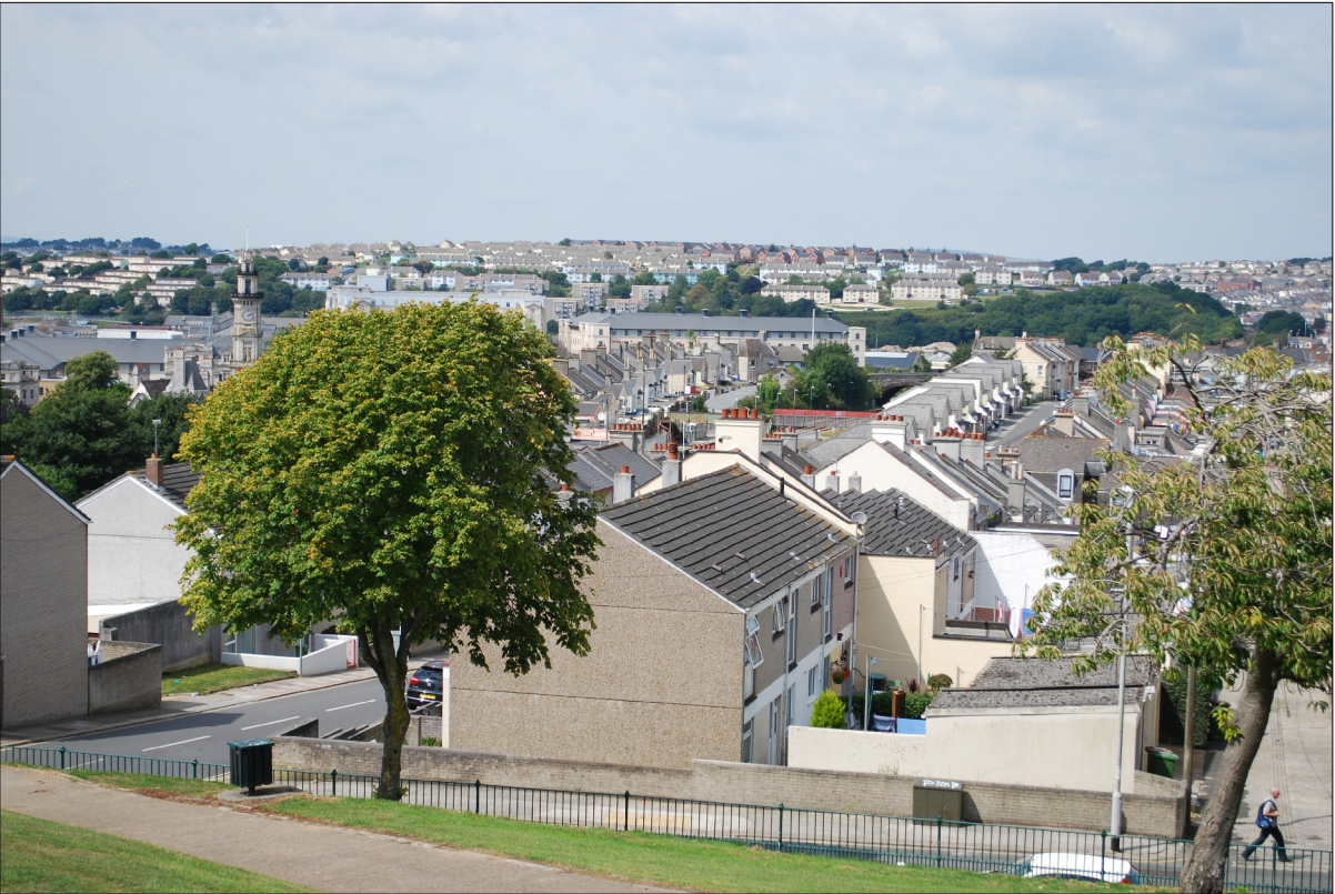
Viewpoint 19 Summer