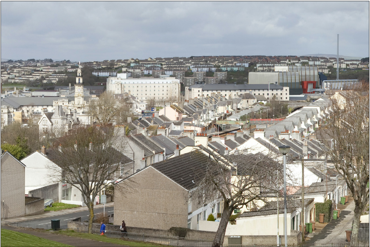
Proposed view 19

Note: Photomontage does not show landscape proposals.