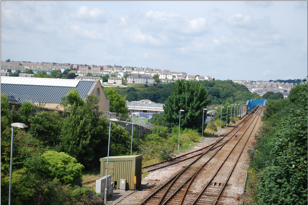
Viewpoint 16 Summer