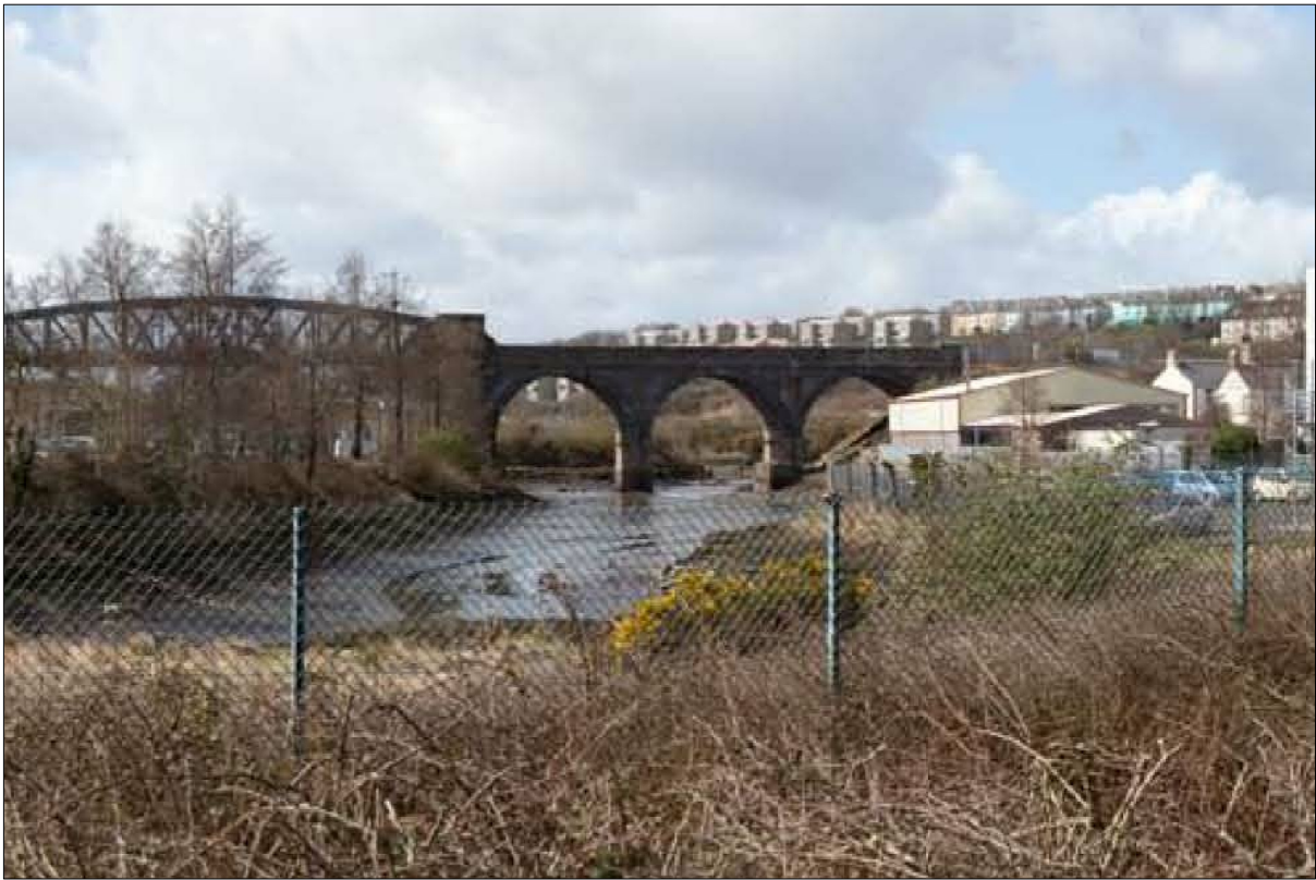
Viewpoint 13b Winter

THIS DRAWING MAY BE USED ONLY FOR THE PURPOSE INTENDED AND ONLY WRITTEN DIMENSIONS SHALL BE USED