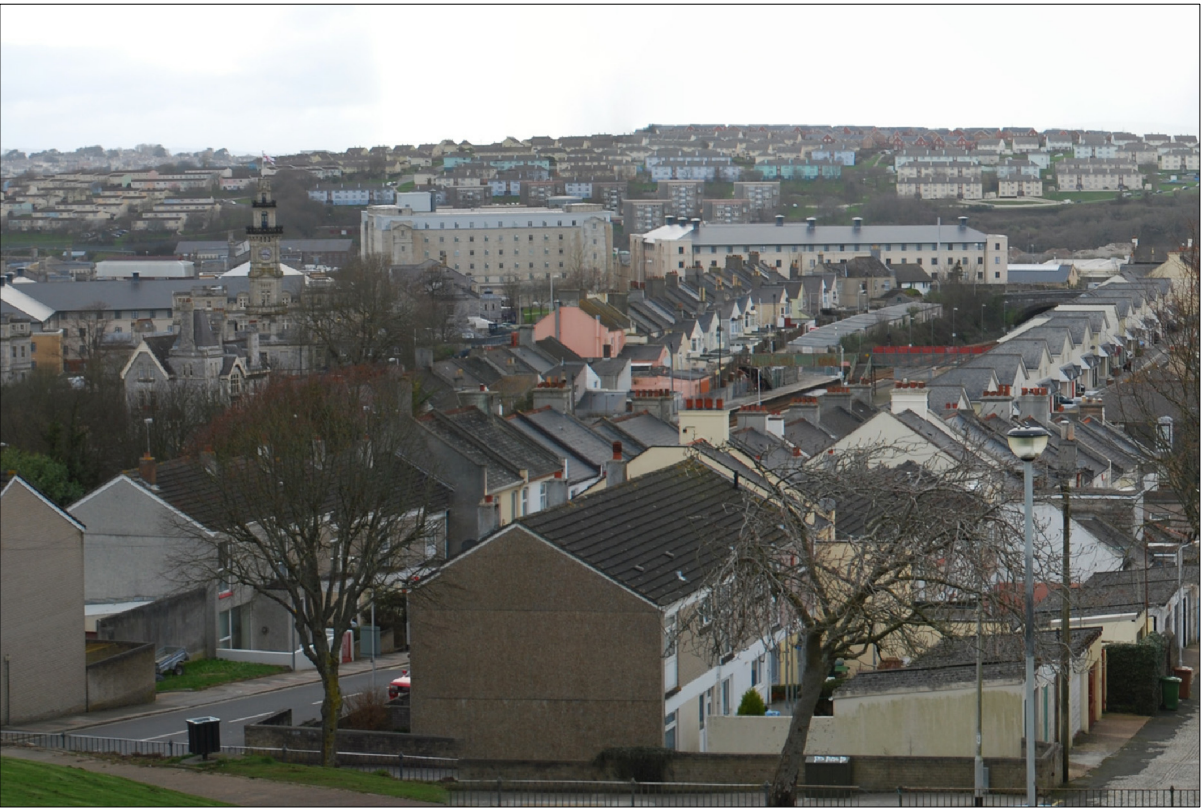
Viewpoint 19 Winter

THIS DRAWING MAY BE USED ONLY FOR THE PURPOSE INTENDED AND ONLY WRITTEN DIMENSIONS SHALL BE USED