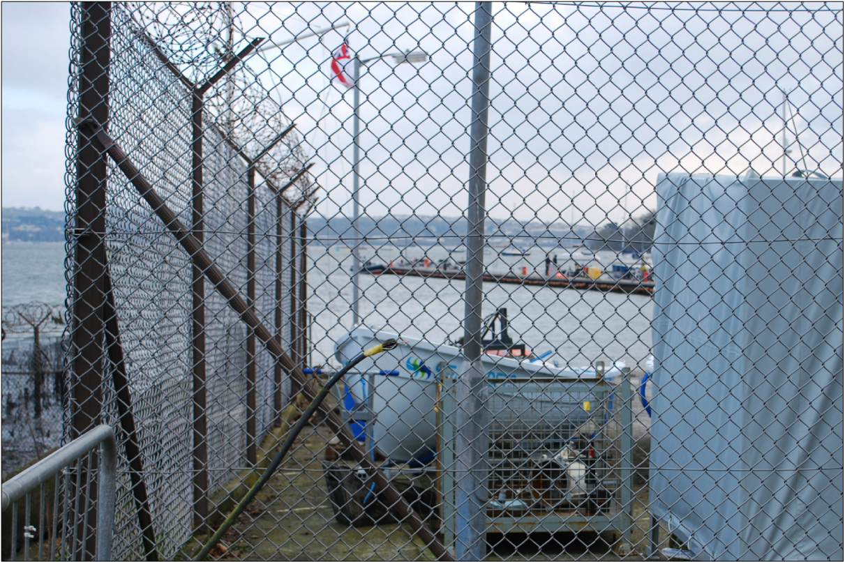
Viewpoint 26 Winter