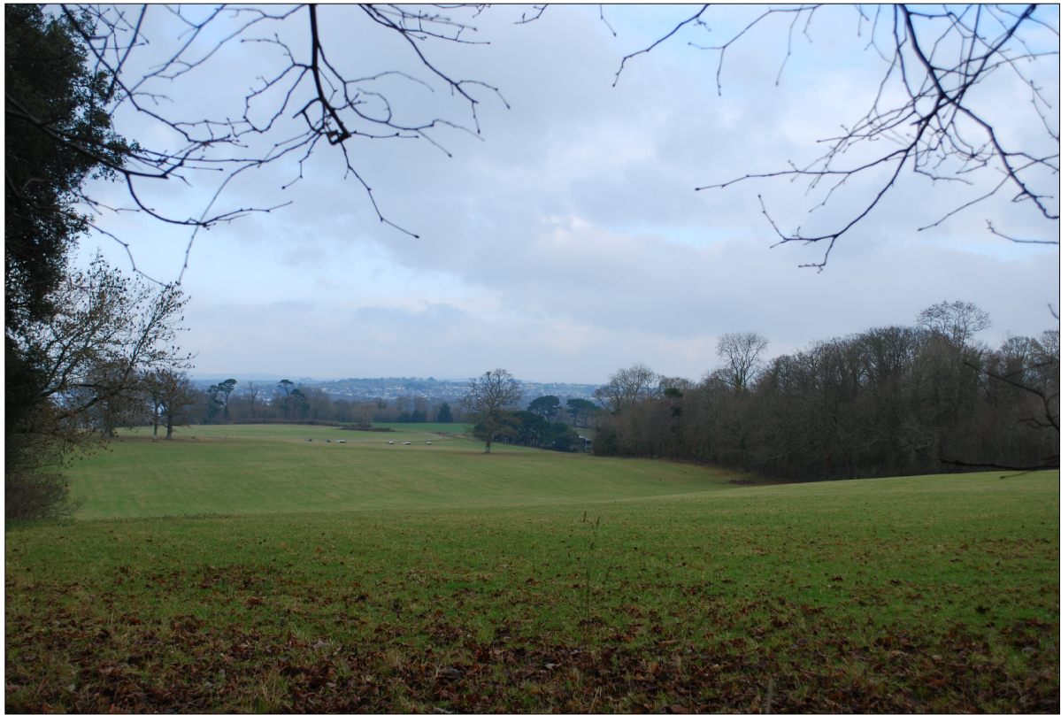
Viewpoint 28 Winter

THIS DRAWING MAY BE USED ONLY FOR THE PURPOSE INTENDED AND ONLY WRITTEN DIMENSIONS SHALL BE USED