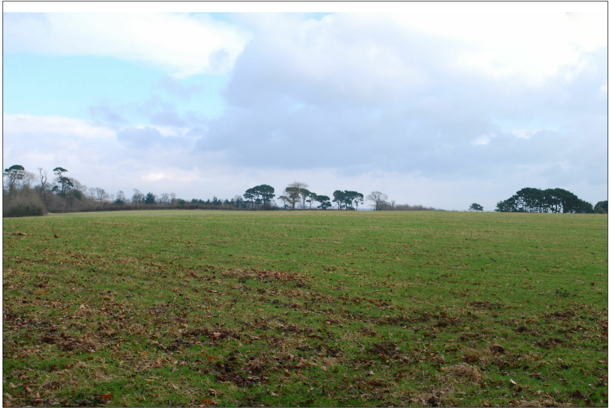
Viewpoint 27 Winter

THIS DRAWING MAY BE USED ONLY FOR THE PURPOSE INTENDED AND ONLY WRITTEN DIMENSIONS SHALL BE USED