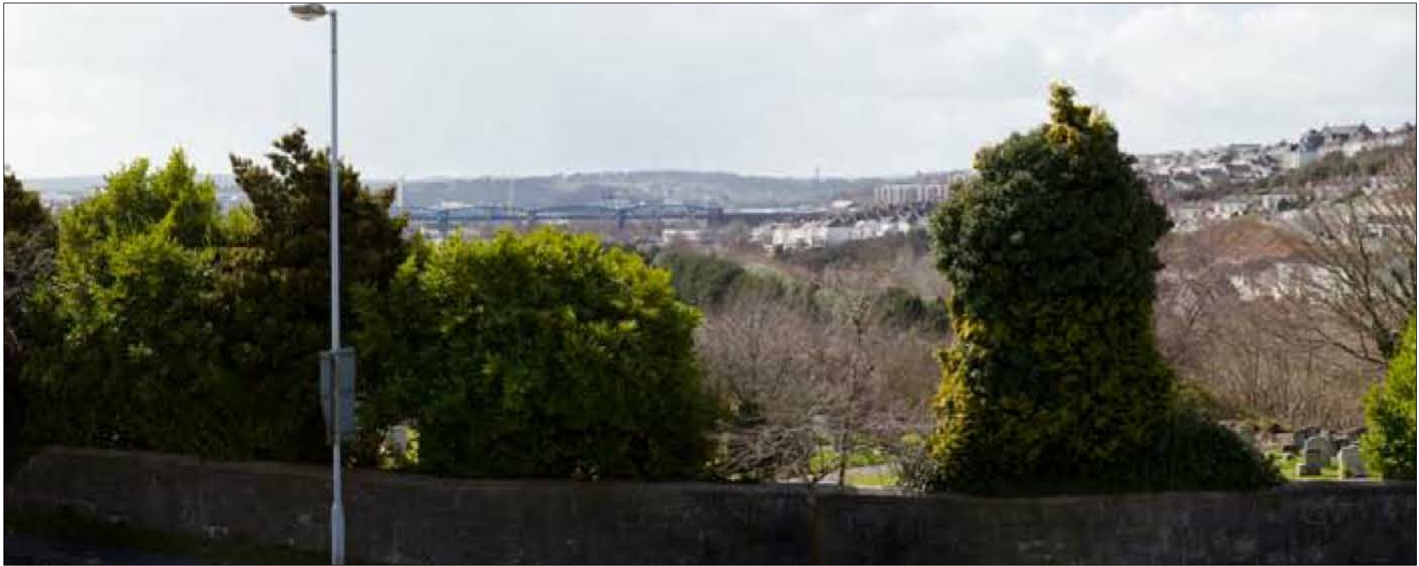
Viewpoint 12 Winter

THIS DRAWING MAY BE USED ONLY FOR THE PURPOSE INTENDED AND ONLY WRITTEN DIMENSIONS SHALL BE USED