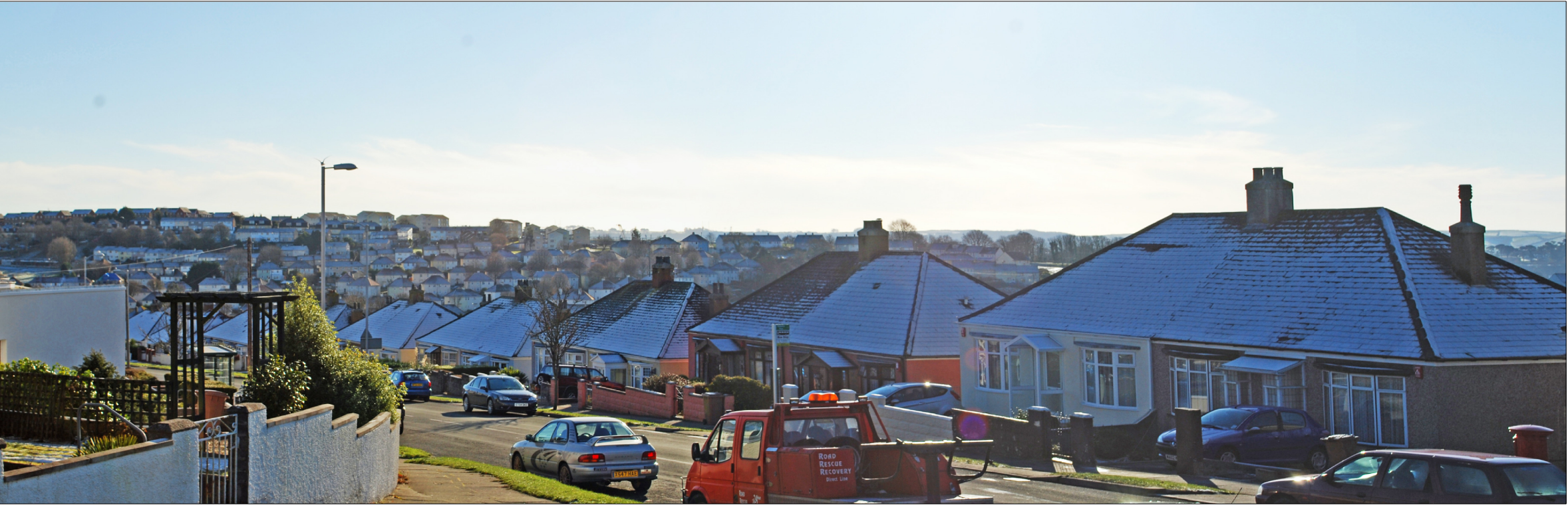
Viewpoint 21 Winter

THIS DRAWING MAY BE USED ONLY FOR THE PURPOSE INTENDED AND ONLY WRITTEN DIMENSIONS SHALL BE USED