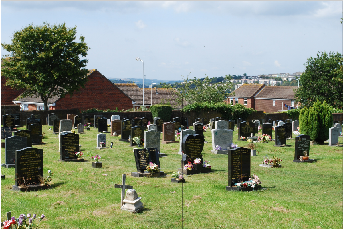
Viewpoint 14 Summer