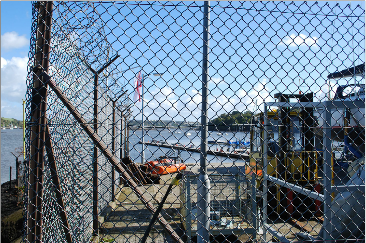
Viewpoint 26 Summer

THIS DRAWING MAY BE USED ONLY FOR THE PURPOSE INTENDED AND ONLY WRITTEN DIMENSIONS SHALL BE USED