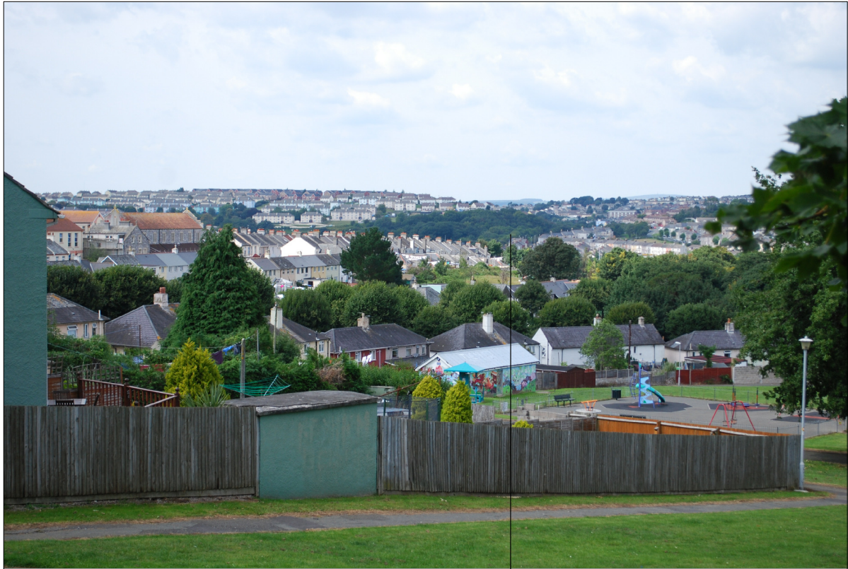
Viewpoint 18 Summer