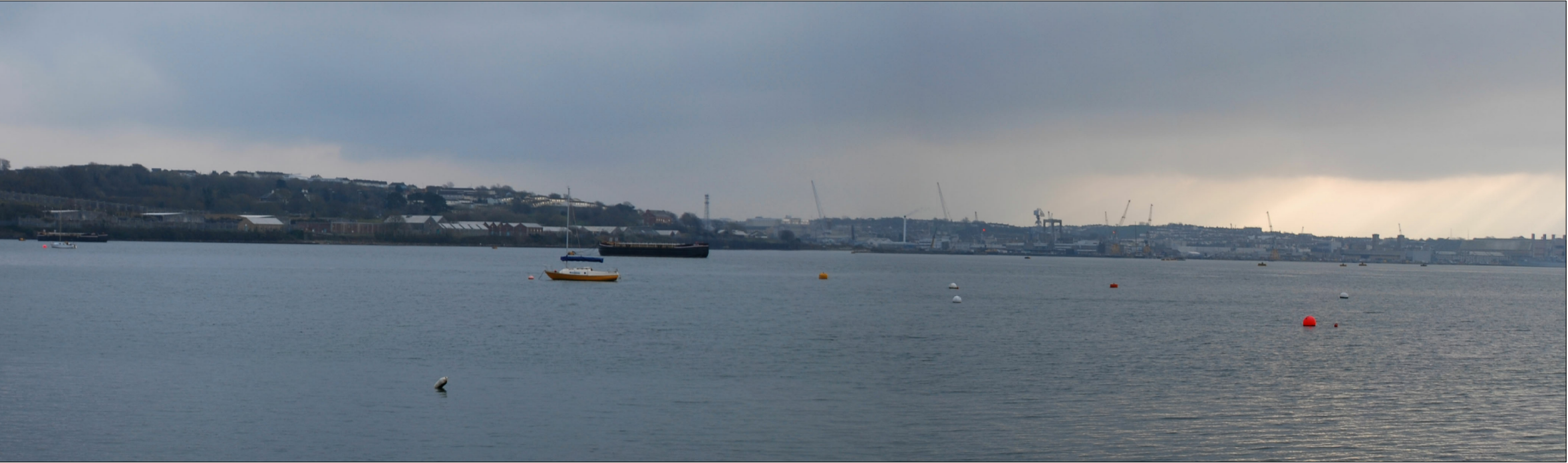
Viewpoint 25 Winter

THIS DRAWING MAY BE USED ONLY FOR THE PURPOSE INTENDED AND ONLY WRITTEN DIMENSIONS SHALL BE USED