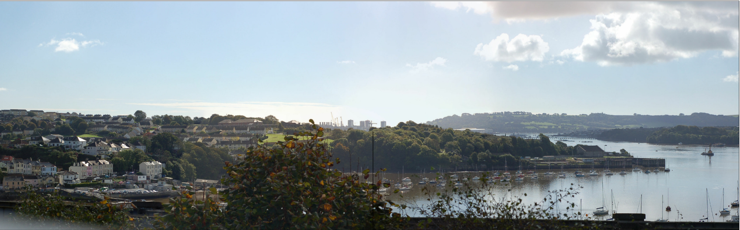
Viewpoint 23 Summer