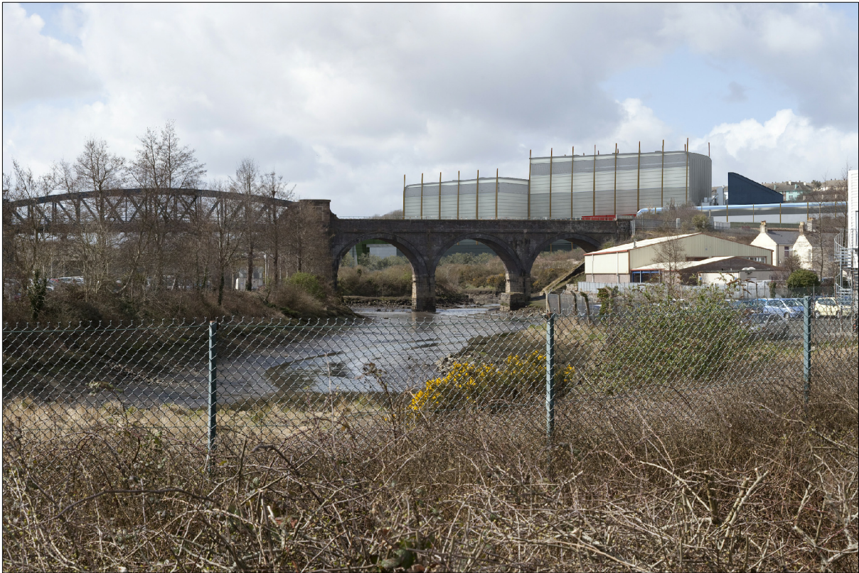
Proposed view 13b

Note: Photomontage does not show landscape proposals.