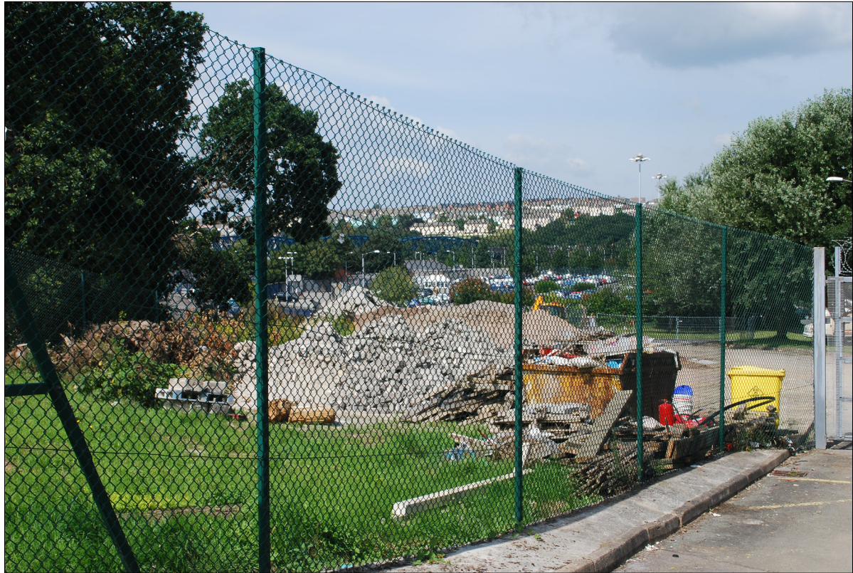
Viewpoint 15 Summer