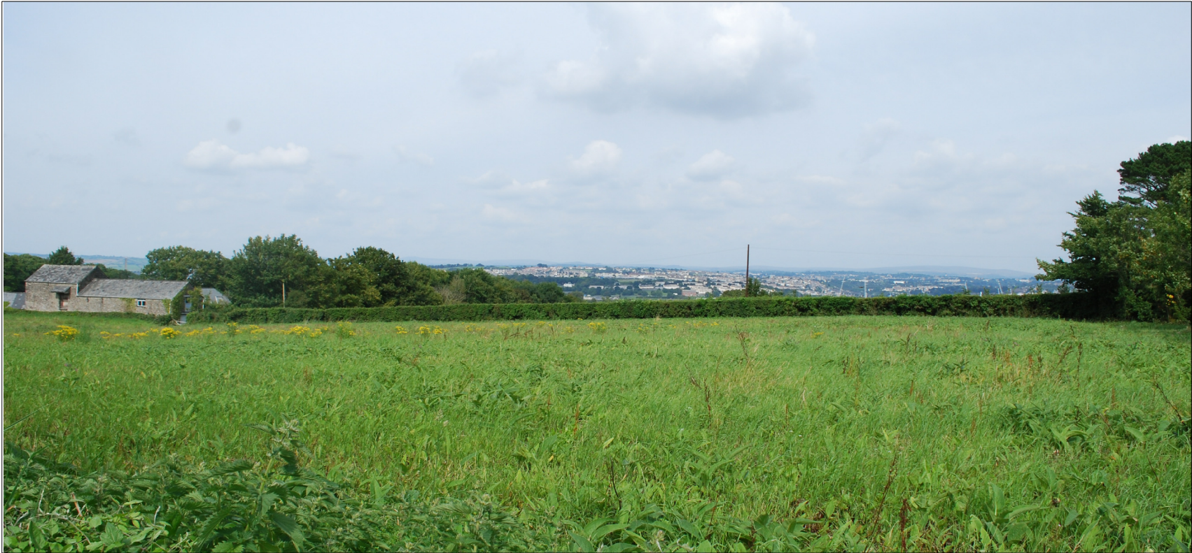
Viewpoint 29 Summer