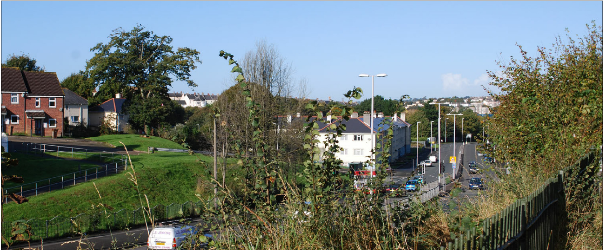
Viewpoint 17 Summer