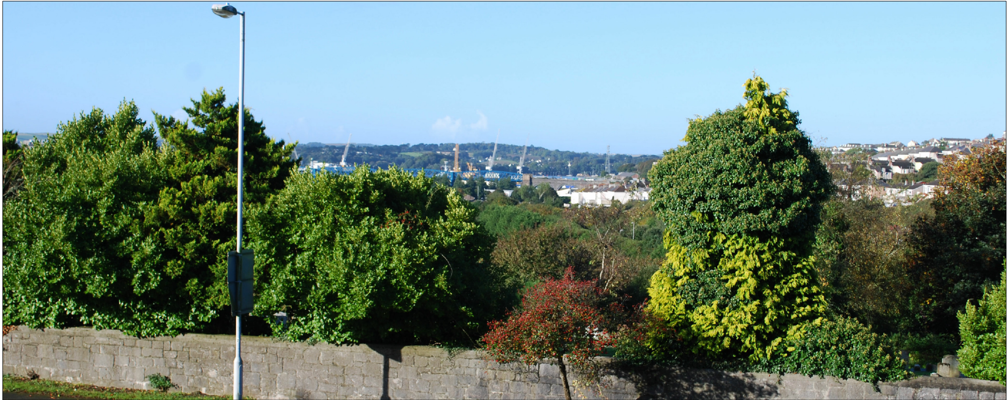
Viewpoint 12 Summer