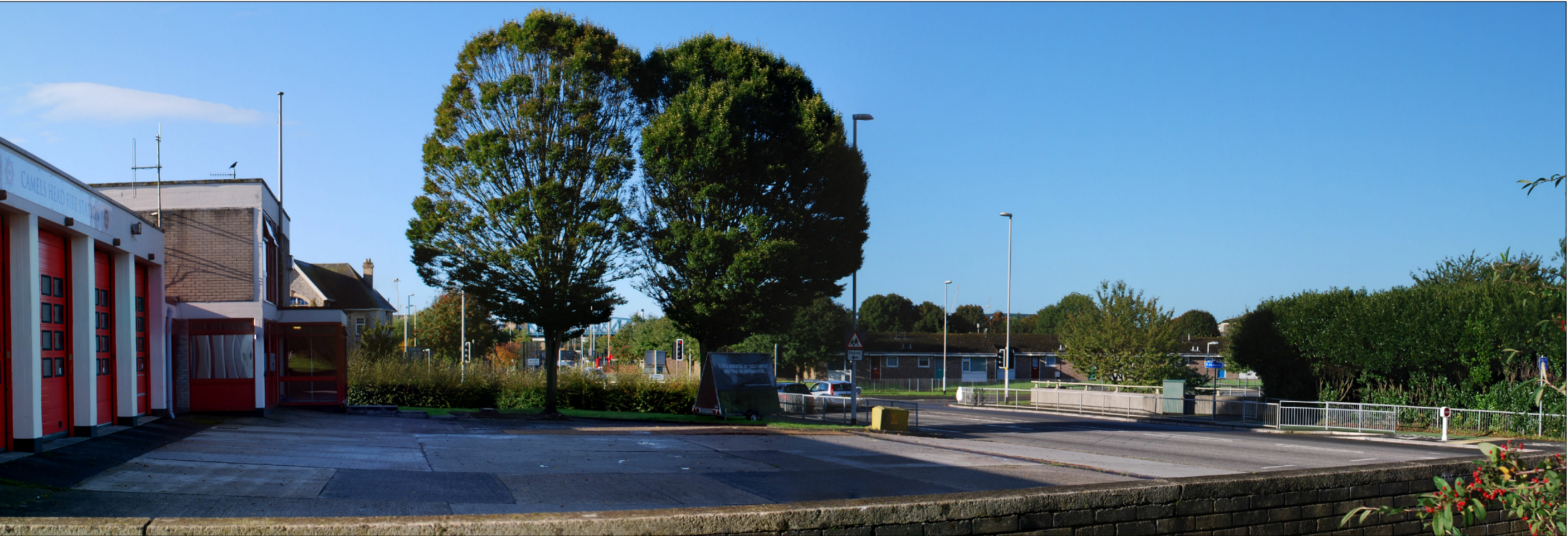
Viewpoint 13 Summer