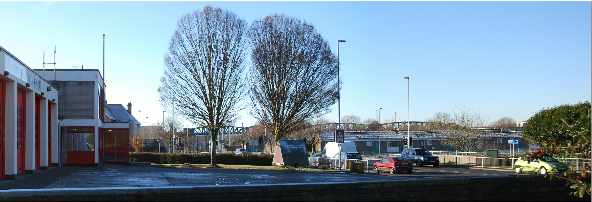
Viewpoint 13 Winter

THIS DRAWING MAY BE USED ONLY FOR THE PURPOSE INTENDED AND ONLY WRITTEN DIMENSIONS SHALL BE USED