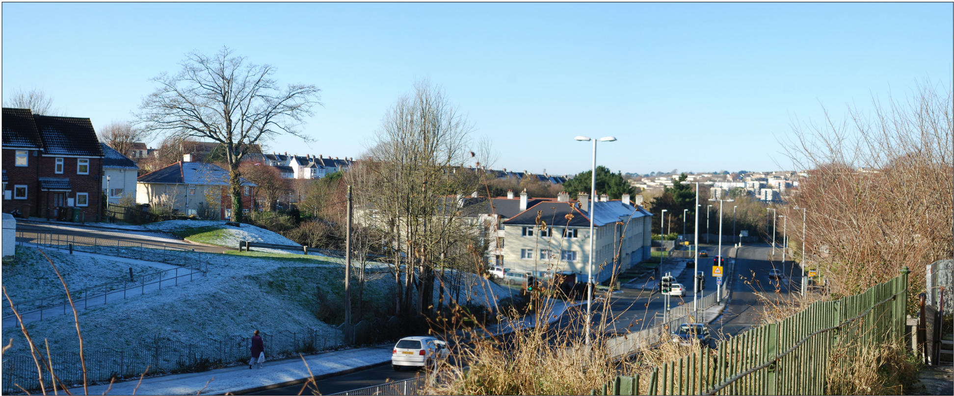
Viewpoint 17 Winter

THIS DRAWING MAY BE USED ONLY FOR THE PURPOSE INTENDED AND ONLY WRITTEN DIMENSIONS SHALL BE USED