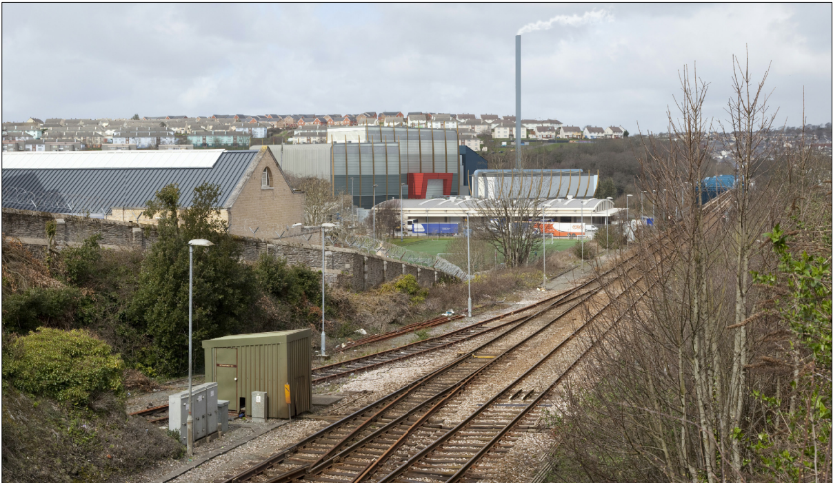
Proposed view 16

Note: Photomontage does not show landscape proposals.