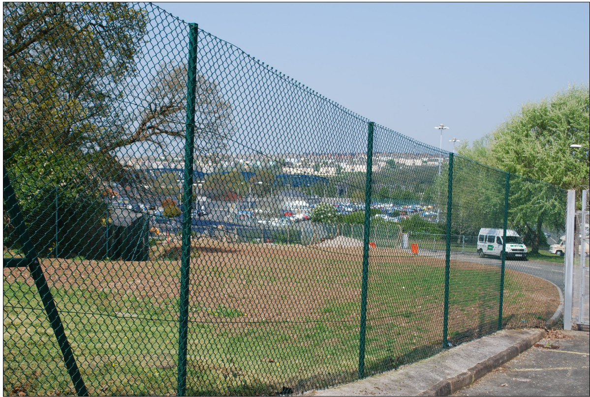
Viewpoint 15 Winter

THIS DRAWING MAY BE USED ONLY FOR THE PURPOSE INTENDED AND ONLY WRITTEN DIMENSIONS SHALL BE USED