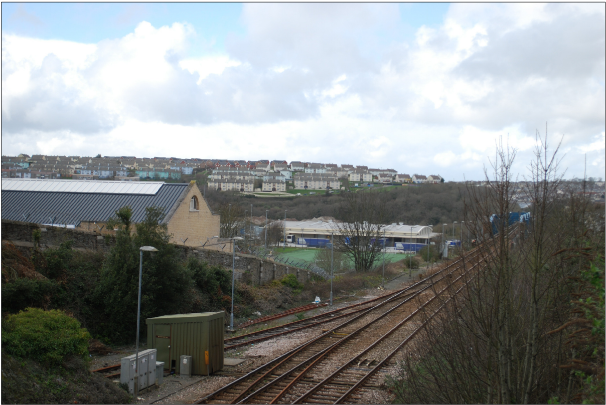
Viewpoint 16 Winter

THIS DRAWING MAY BE USED ONLY FOR THE PURPOSE INTENDED AND ONLY WRITTEN DIMENSIONS SHALL BE USED