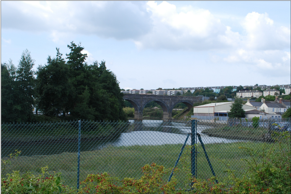
Viewpoint 13b Summer