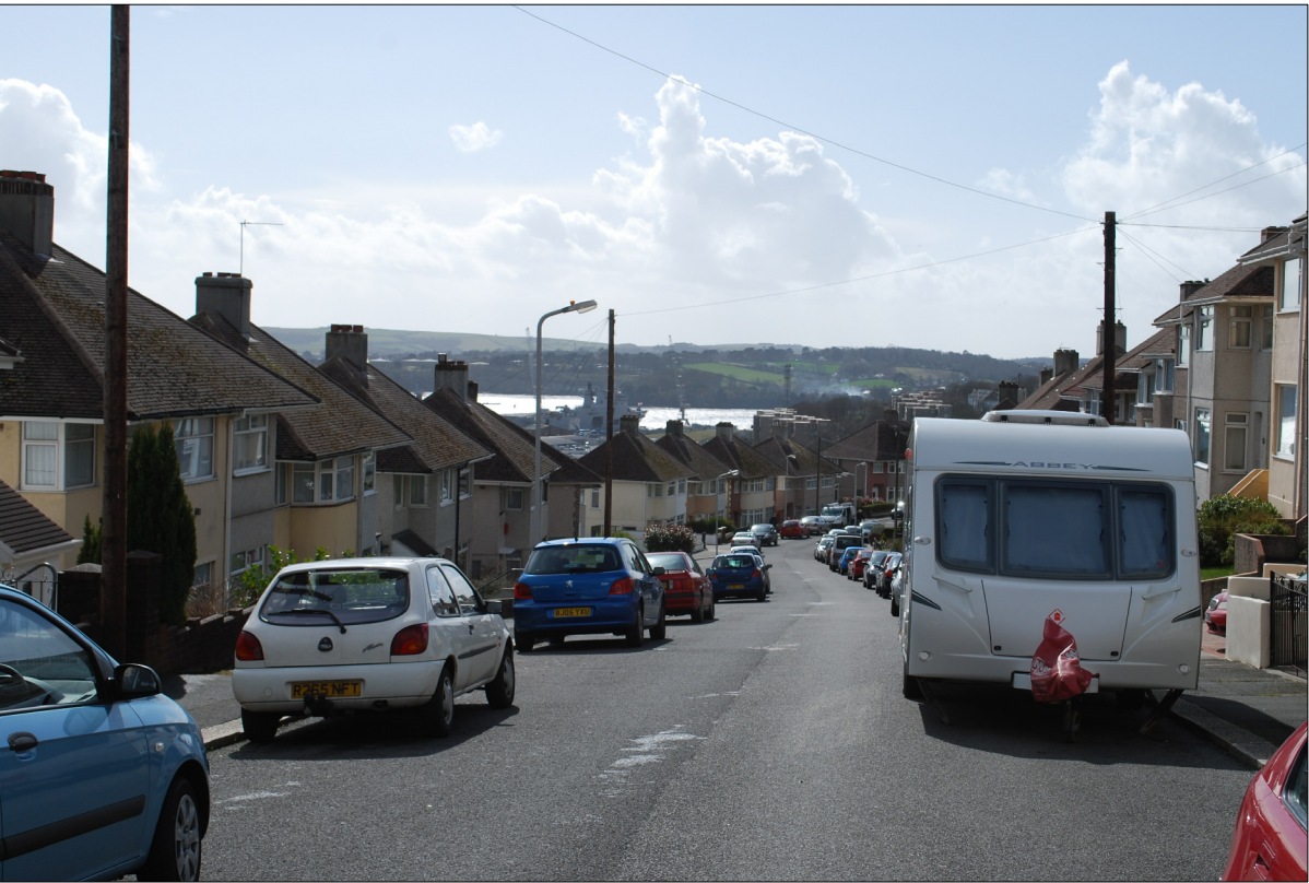
Viewpoint 11 Winter

THIS DRAWING MAY BE USED ONLY FOR THE PURPOSE INTENDED AND ONLY WRITTEN DIMENSIONS SHALL BE USED