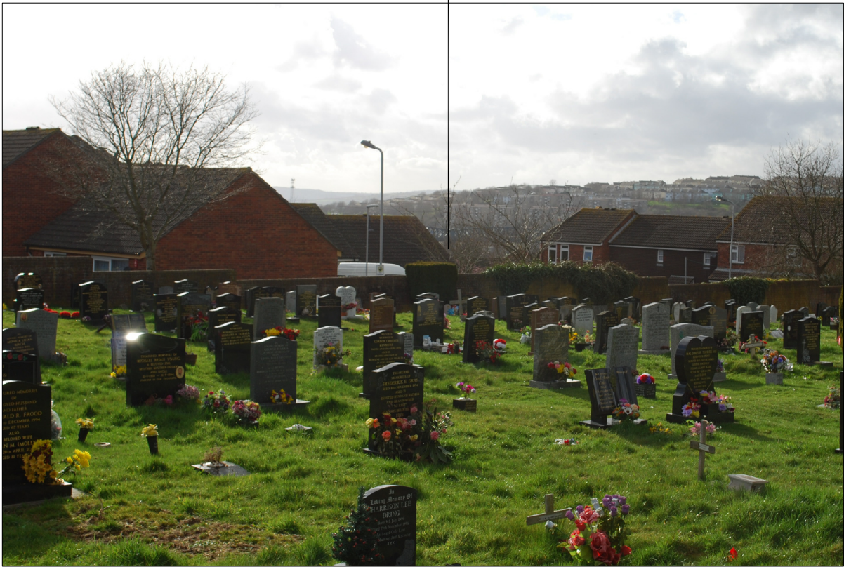
Viewpoint 14 Winter

THIS DRAWING MAY BE USED ONLY FOR THE PURPOSE INTENDED AND ONLY WRITTEN DIMENSIONS SHALL BE USED