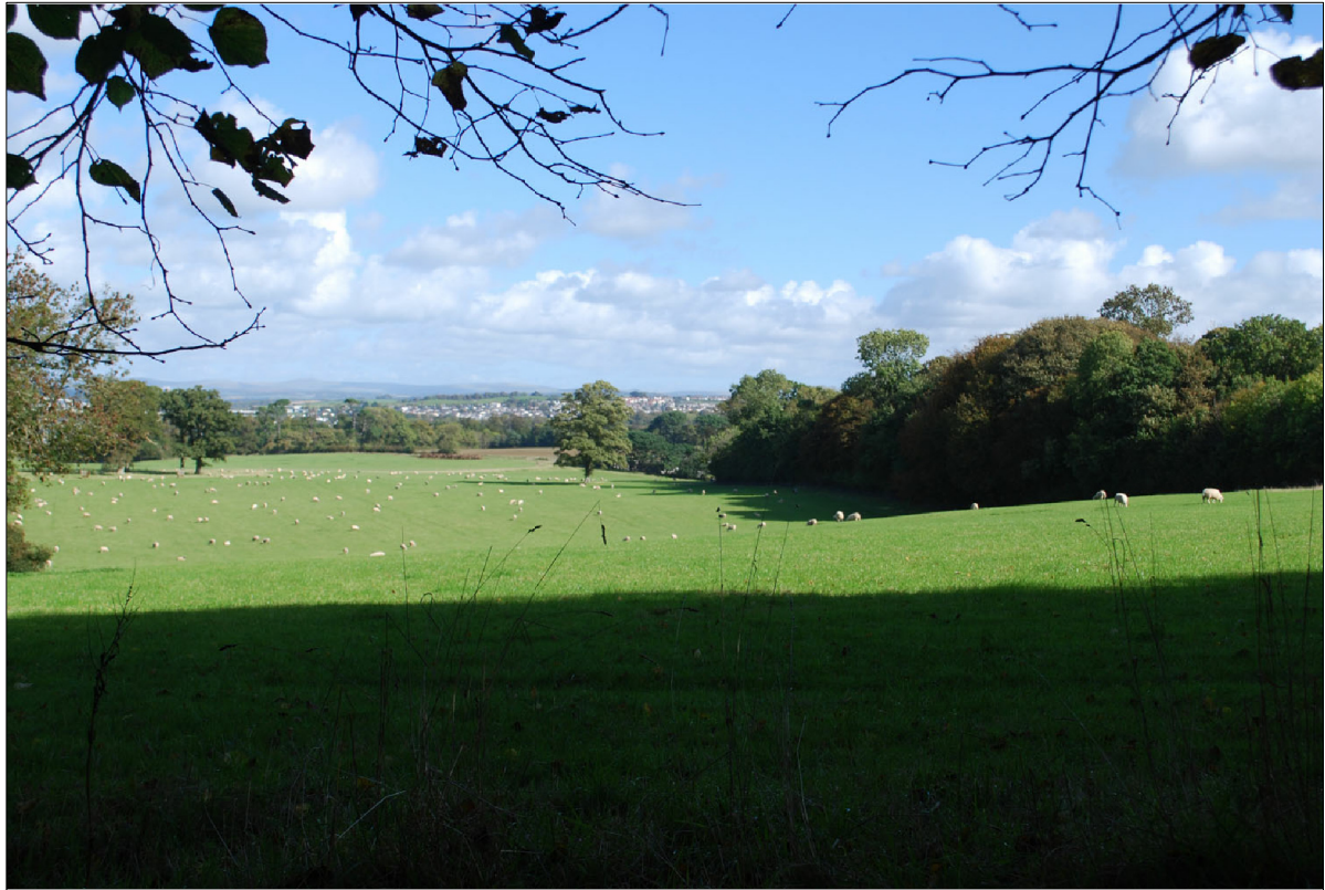
Viewpoint 28 Summer