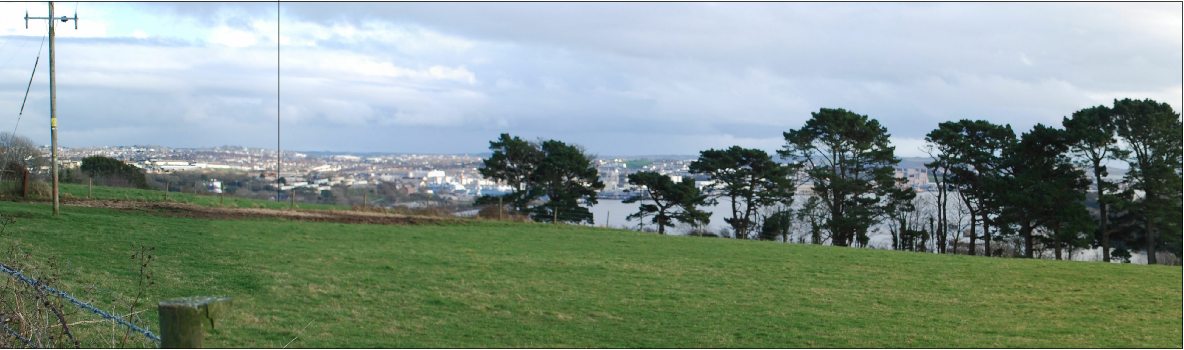
Viewpoint 24 Winter

THIS DRAWING MAY BE USED ONLY FOR THE PURPOSE INTENDED AND ONLY WRITTEN DIMENSIONS SHALL BE USED