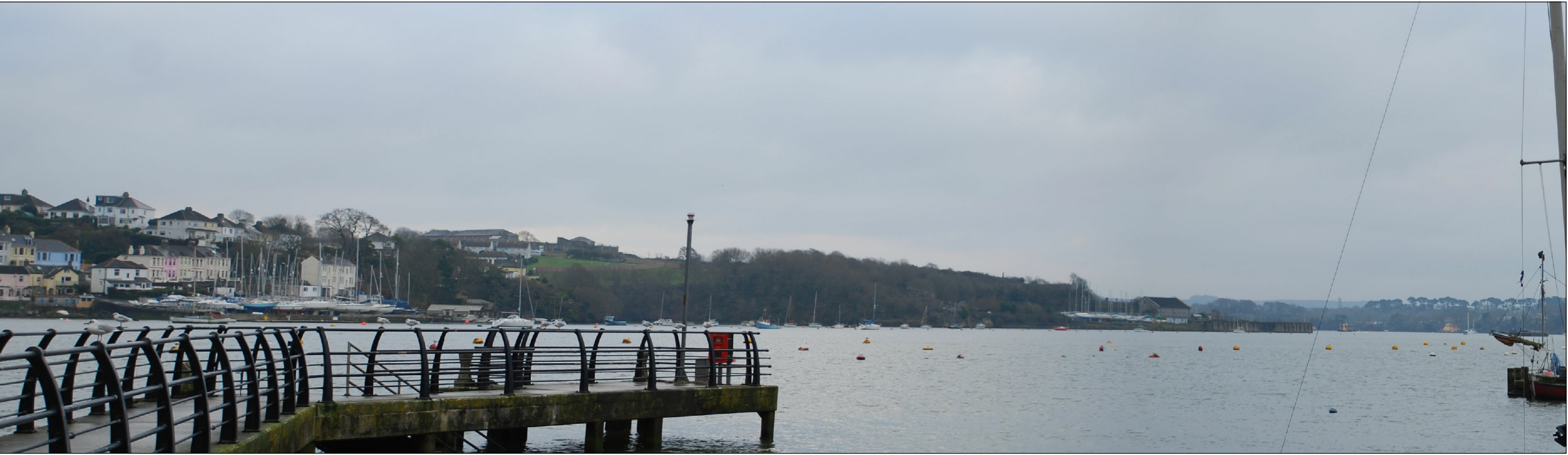
Viewpoint 22 Winter

THIS DRAWING MAY BE USED ONLY FOR THE PURPOSE INTENDED AND ONLY WRITTEN DIMENSIONS SHALL BE USED